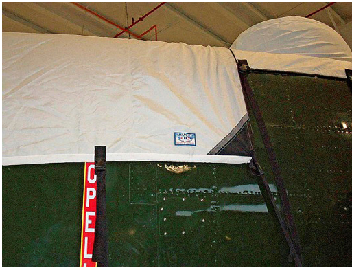
B25 Gun Turret Cover