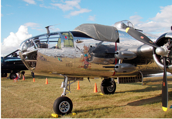
Mitchell B25 Cockpit Cover (Snap-On Type)

This cover type is made from Silver Acrylic Sunbrella canvas and is 100% lined with a soft and smooth microfiber. Bruce's Custom Covers developed this material combination especially for aircraft protection. The outer material is medium weight and treated for water resistance, UV resistance and anti-static buildup. The inner lining is a very soft and smooth microfiber to prevent scratching. The material is very reflective, and tests show that the cabin interior temperature can be reduced to near-ambient temperature on the hottest of days. It is water, ice and snow repellent, yet breathable to allow moisture to escape from between the cover and the aircraft surface.