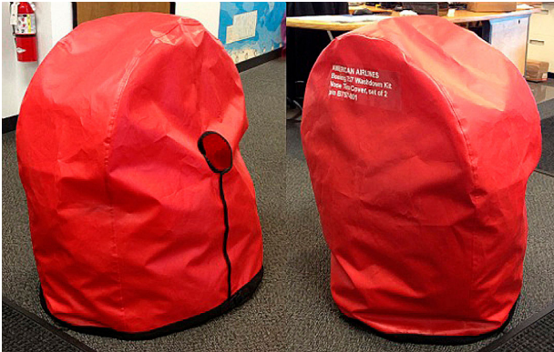
Boeing 757 Tire Covers, great for Wash Prep or Storage

ALL-YEAR USE MATERIAL - Made with Silver Acrylic Sunbrella canvas, the all-year use material is the best option for sun protection and cover longevity. This heavier more durable material is intended for all weather conditions, such as rain and snow or lots of sun.