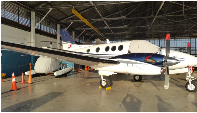
Raytheon Beech King Air Cockpit Cover, Prop Tie/Exhaust Covers, Inlet Plugs