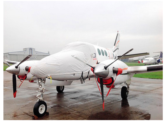
King Air Cockpit/Nose Cover, Plugs, Prop Tie/Exhaust Covers