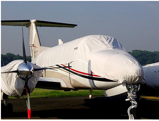
King Air 350 Canopy/Nose Cover, Engine Covers