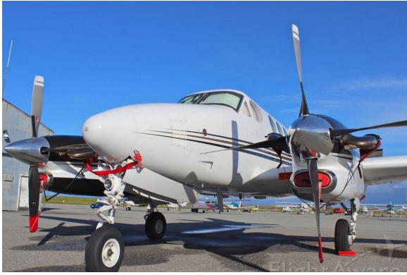
King Air C90A Engine Plugs and Pitot Covers

for cockpit overheating, but an external fabric cover is more effective for long-term protection.