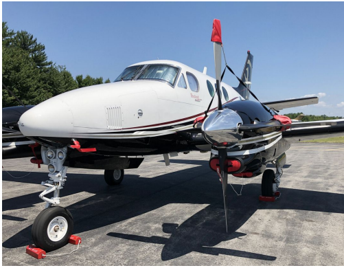
Beech C90A Prop Tie Downs/Exhaust Covers

be inserted after flight when the engine is still warm. Engine Inlet Plugs are commonly referred to as Cowl Plugs, Intake Plugs, Cowl Blocks, Engine Blocks, and Engine Bunges.