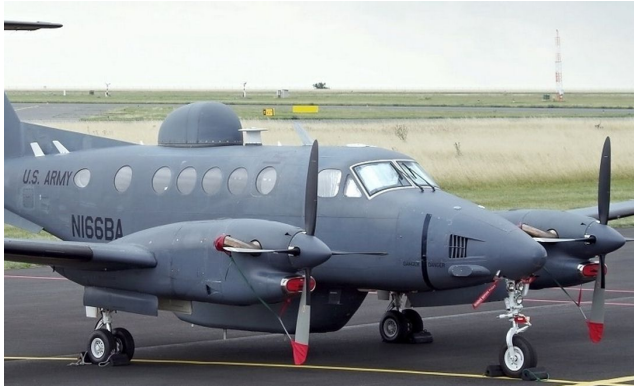
Beech King Air 300 Cockpit HeatShields, Engine Plugs, Prop Ties

for cockpit overheating, but an external fabric cover is more effective for long-term protection.