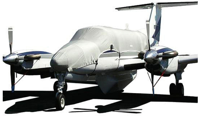
King Air Canopy/Nose Cover