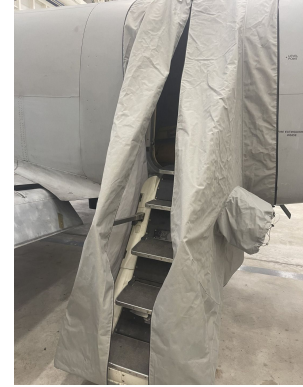
King Air Airstair Door Cover