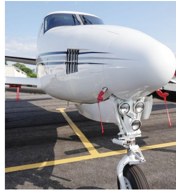
Beech King Air C90 Pitot Covers, Heat Exchanger Plugs