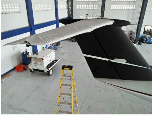
Beech King Air B350 Horizontal Stabilizer Covers

WINTER USE MATERIAL - Made with Solution-Dyed Polyester fabric, this option is intended for seasonal use to aid in deicing, rain mitigation, or for occasional travel. The material is lighter and more compact, but more susceptible to UV damage and may have a shorter useful life if used continuously outside than the all-year use material.