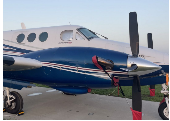
Beech King Air C90 Cockpit HeatShields