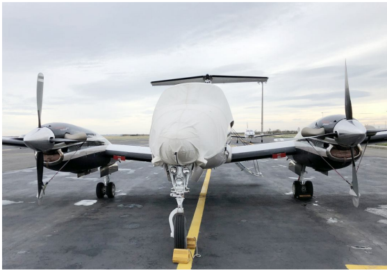
King Air 200 Canopy/Nose Cover