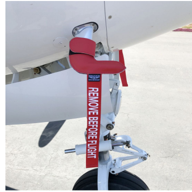
Beech King Air Pitot Covers