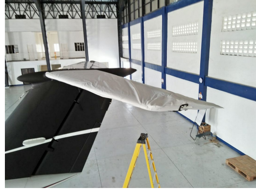
Beech King Air B350 Horizontal Stabilizer Covers