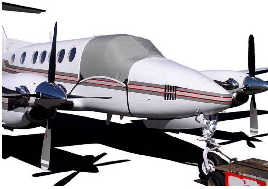
King Air 200/300 Snap-On Windshield Cover