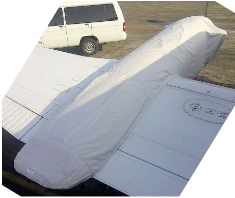
King Air 350 Engine Cover

The material is very reflective, and tests show that the cabin interior temperature can be reduced to near-ambient temperature on the hottest of days. It is water, ice and snow repellent, yet breathable to allow moisture to escape from between the cover and the aircraft surface.