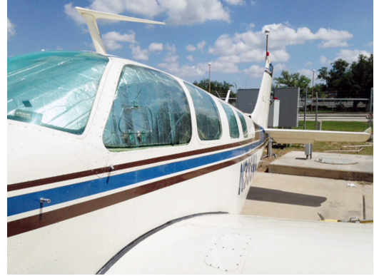
Beech Bonanza HeatShields