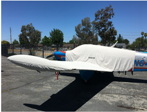
Beech Bonanza A36 Wing Covers with D'Shannon Tip Tanks, Extended Canopy Cover

Designed to prevent damage to the aircraft extremities in crowded hangars, these products are made of bright red Naugahyde and thickly padded with a sandwich of closed cell foam.