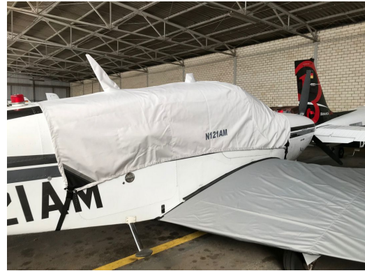
Beech Bonanza Canopy and Wing Covers