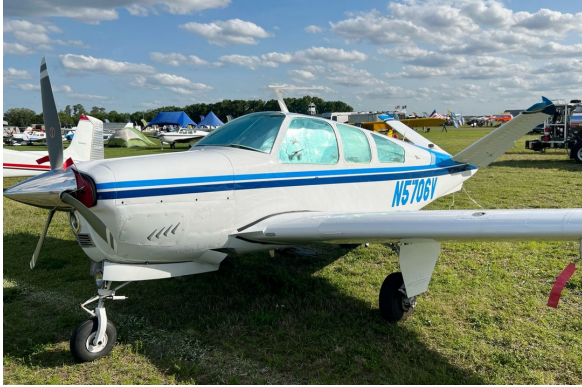
Beech Bonanza HeatShield Set

Windshield Heatshields are interior sunshades for an aircraft's front windshield. The product is a unique composite of closed-cell foam with a silver mylar finish. The semi-rigid design is stiff enough to stand along the inside of the windshield using sun visors or window framing. It folds up flat and easily stores in the included storage sleeve. Some designs may require velcro and suction cups or split right and left sides. A Heatshield is an excellent short-term remedy for cockpit overheating. An external fabric cover is far more effective and practical for long-term protection.