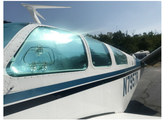
Beechcraft V35A Bonanza Heatshield Set