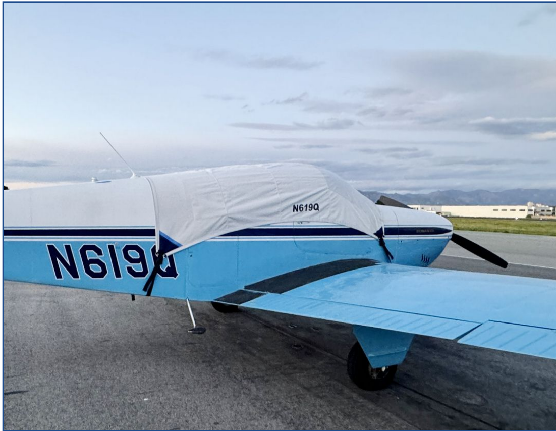
Beech Bonanza Canopy Cover