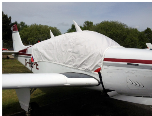
Beech Bonanza/Debonair Canopy Cover