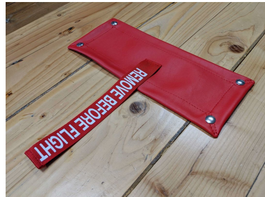
Beech Bonanza/Debonair Induction Air Filter Inlet Cover