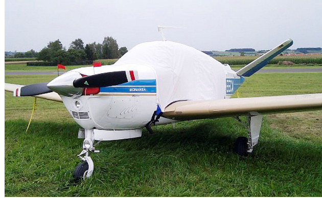
Bonanza Extended Canopy Cover & Engine Inlet Plugs