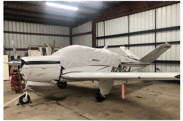
Beech Bonanza V35B Canopy Cover