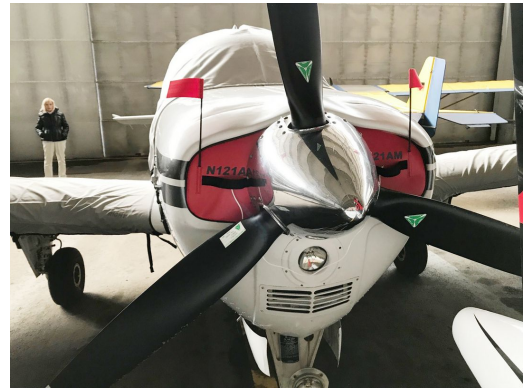
Beech Bonanza Engine Plugs