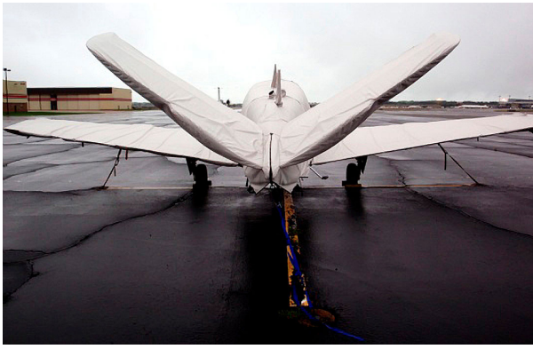
Beech Bonanza V-Tail Full Cover Set