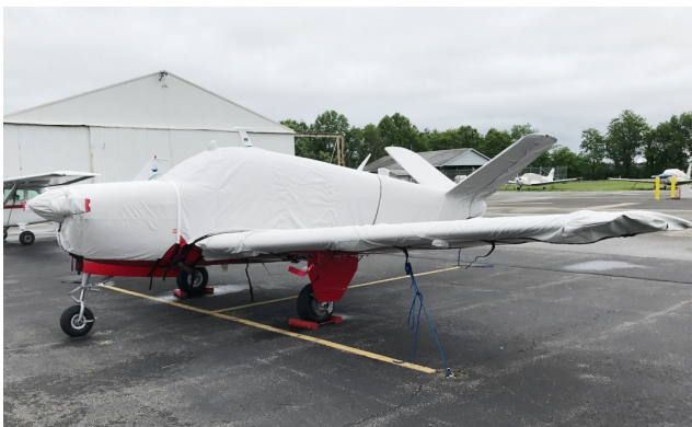
Beech Bonanza/Debonair Extended Canopy Cover (Specify Lg Or Sm Windshield & Lg Or Sm 3rd Window)