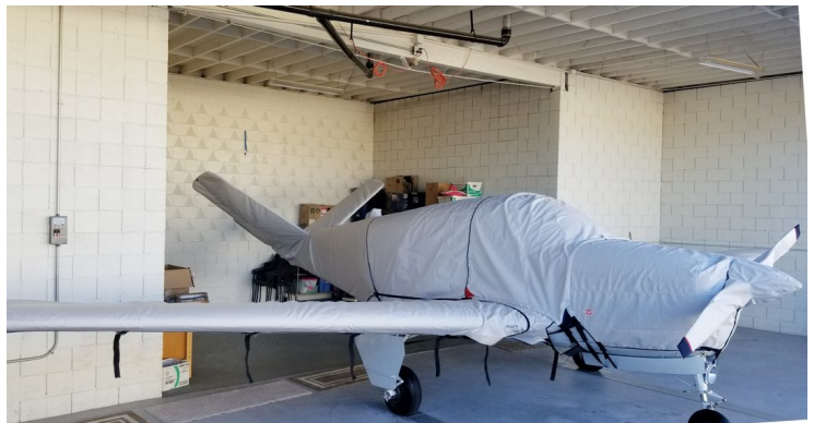
Bonanza N35 Extended Canopy, Engine, Empennage, Wing & Prop Covers