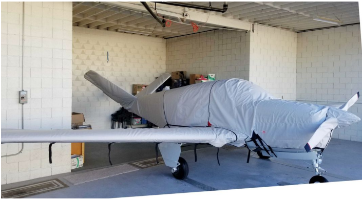
Beech Bonanza N35 Complete Cover Set