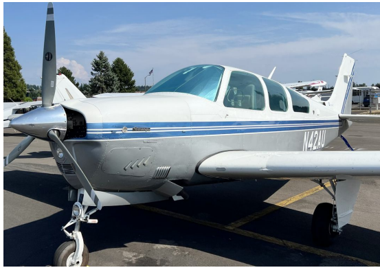
Beech Bonanza F33A Windshield HeatShield