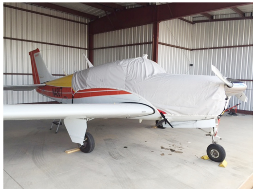
Beech Bonanza Canopy/Engine Cover