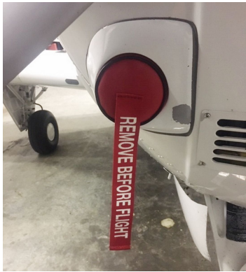
BEECH V35B Tornado Alley Turbo Inlet Plug

Engine Inlet Plugs are custom fit for your Beech Bonanza/Debonair intakes, made with heavy-duty vinyl material, and stuffed with a single block of sculpted urethane foam. Each plug has a zipper that allows the foam to be removed and dried if necessary. Engine plugs have warning flags that are visible from the cockpit or 'remove before flight' streamers sewn onto the face of the plugs. Most plugs are imprinted with the aircraft registration number in black for an extra charge. Storage bag NOT included. Engine plugs may be inserted after flight when the engine is still warm. Engine Inlet Plugs are commonly referred to as Cowl Plugs, Intake Plugs, Cowl Blocks, Engine Blocks, and Engine Bungs. Designed to prevent damage to the aircraft extremities in crowded hangars, these products are made of bright red Naugahyde and thickly padded with a sandwich of closed cell foam.