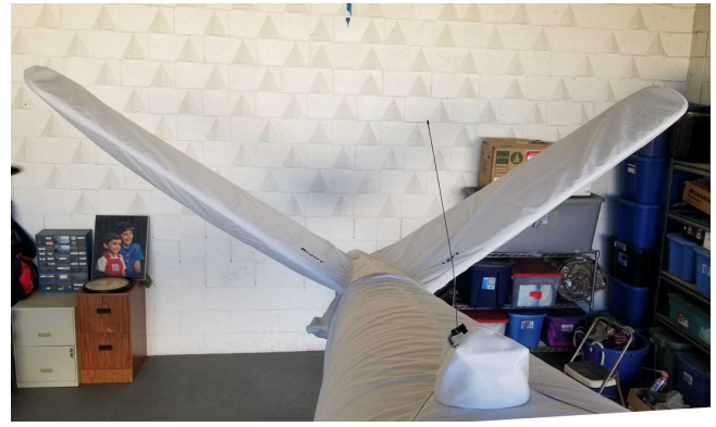
Beech Bonanza N35 Empennage Cover