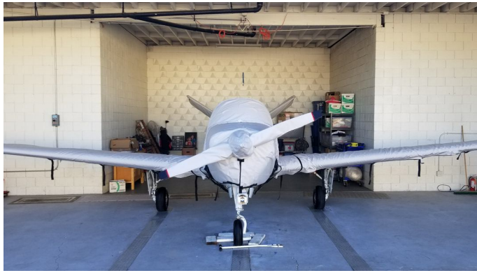
Bonanza N35 Extended Canopy, Engine, Empennage, Wing & Prop Covers