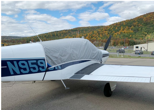
Beech Bonanza Travel Canopy Cover

Travel Covers are made with Silver Solution-Dyed Polyester fabric and only lined over the windshield to save weight. The material is lightweight and more compact for easy stowage in the aircraft. The polyester material is water resistant, but only intended for occasional use outside. We also have an ultra lightweight material available for fitted hangar dust covers. For daily outdoor use, the non-travel Sunbrella Cover is the best choice.