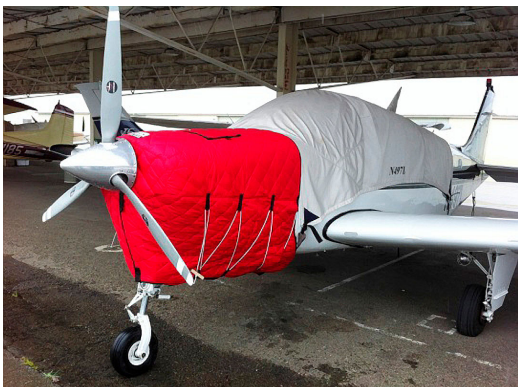
Beech Bonanza Insulated Engine Cover, fully enclosed

This cover type is made from Silver Acrylic Sunbrella canvas and is 100% lined with a soft and smooth microfiber. Bruce's Custom Covers developed this material combination especially for aircraft protection. The outer material is medium weight and treated for water resistance, UV resistance and anti-static buildup. The inner lining is a very soft and smooth microfiber to prevent scratching. The material is very reflective, and tests show that the cabin interior temperature can be reduced to near-ambient temperature on the hottest of days. It is water, ice and snow repellent, yet breathable to allow moisture to escape from between the cover and the aircraft surface.