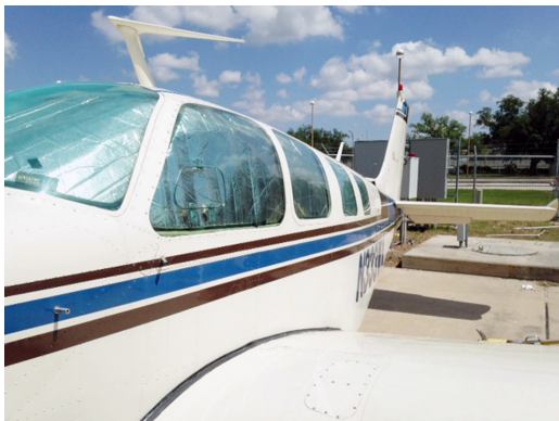
Beech Bonanza HeatShields

Travel Covers are made with Silver Solution-Dyed Polyester fabric and only lined over the windshield to save weight. The material is lightweight and more compact for easy stowage in the aircraft. The polyester material is water resistant, but only intended for occasional use outside. We also have an ultra lightweight material available for fitted hangar dust covers. For daily outdoor use, the non-travel Sunbrella Cover is the best choice.