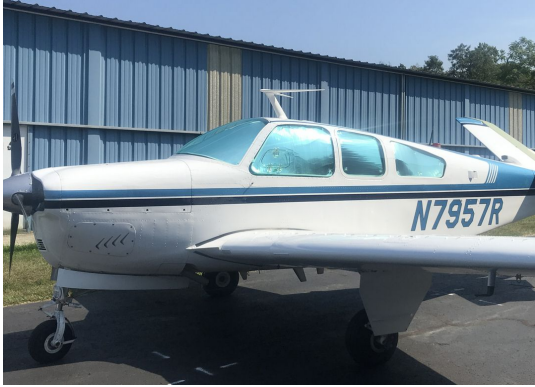
Beechcraft V35A Bonanza Heatshield Set

Windshield Heatshields are interior sunshades for an aircraft's front windshield. The product is a unique composite of closed-cell foam with a silver mylar finish. The semi-rigid design is stiff enough to stand along the inside of the windshield using sun visors or window framing. It folds up flat and easily stores in the included storage sleeve. Some designs may require velcro and suction cups or split right and left sides. A Heatshield is an excellent short-term remedy for cockpit overheating. An external fabric cover is far more effective and practical for long-term protection.