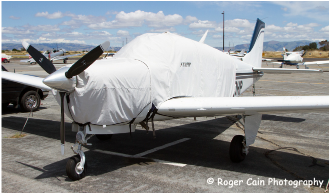
Beech Bonanza Engine and Canopy Cover

This cover type is made from Silver Acrylic Sunbrella canvas and is 100% lined with a soft and smooth microfiber. Bruce's Custom Covers developed this material combination especially for aircraft protection. The outer material is medium weight and treated for water resistance, UV resistance and anti-static buildup. The inner lining is a very soft and smooth microfiber to prevent scratching. The material is very reflective, and tests show that the cabin interior temperature can be reduced to near-ambient temperature on the hottest of days. It is water, ice and snow repellent, yet breathable to allow moisture to escape from between the cover and the aircraft surface.