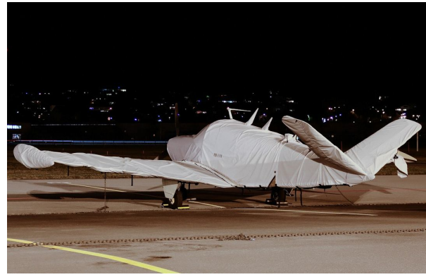
Beech Bonanza Extended Canopy/Engine, Empennage & Wing Covers (with tip tanks)