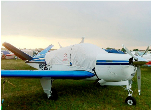
Beech Bonanza Canopy Cover with Commemorative B2Osh logo

Travel Covers are made with Silver Solution-Dyed Polyester fabric and only lined over the windshield to save weight. The material is lightweight and more compact for easy stowage in the aircraft. The polyester material is water resistant, but only intended for occasional use outside. We also have an ultra lightweight material available for fitted hangar dust covers. For daily outdoor use, the non-travel Sunbrella Cover is the best choice.