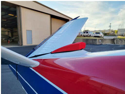
Beech Bonanza Fresh Air Intake Cover

The Beech Bonanza/Debonair Tailcone Cover fits onto the tailcone area to cover the holes that birds can fly into and nest. The cover easily straps onto the leading edge of the horizontal stabilizer with padded hooks or overlaps with the elevators slightly and attaches under the horizontal stabilizers with adjustable straps. Tailcone Covers are normally made with Solution-Dyed Polyester or Acrylic Sunbrella .