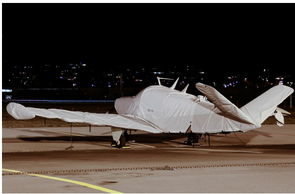
Beech Bonanza Extended Canopy/Engine, Empennage & Wing Covers (with tip tanks)