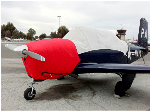
T-34A Insulated Engine Cover