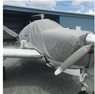
Beech Bonanza V35A Travel Canopy/Engine Cover