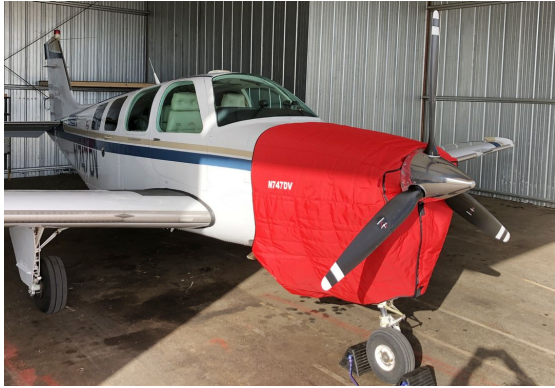
Beech Bonanza Insulated Engine Cover, fully enclosed

This cover type is made from Silver Acrylic Sunbrella canvas and is 100% lined with a soft and smooth microfiber. Bruce's Custom Covers developed this material combination especially for aircraft protection. The outer material is medium weight and treated for water resistance, UV resistance and anti-static buildup. The inner lining is a very soft and smooth microfiber to prevent scratching. The material is very reflective, and tests show that the cabin interior temperature can be reduced to near-ambient temperature on the hottest of days. It is water, ice and snow repellent, yet breathable to allow moisture to escape from between the cover and the aircraft surface.