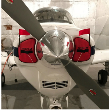
Beech Bonanza Engine Plugs, early models

Engine Inlet Plugs are custom fit for your Beech Bonanza/Debonair intakes, made with heavy-duty vinyl material, and stuffed with a single block of sculpted urethane foam. Each plug has a zipper that allows the foam to be removed and dried if necessary. Engine plugs have warning flags that are visible from the cockpit or 'remove before flight' streamers sewn onto the face of the plugs. Most plugs are imprinted with the aircraft registration number in black for an extra charge. Storage bag NOT included. Engine plugs may be inserted after flight when the engine is still warm. Engine Inlet Plugs are commonly referred to as Cowl Plugs, Intake Plugs, Cowl Blocks, Engine Blocks, and Engine Bungs. Designed to prevent damage to the aircraft extremities in crowded hangars, these products are made of bright red Naugahyde and thickly padded with a sandwich of closed cell foam.