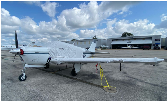
Beech F33C Bonanza Extended Canopy & Wing Covers

WINTER USE MATERIAL - Made with Solution-Dyed Polyester fabric, this option is intended for seasonal use to aid in deicing, rain mitigation, or for occasional travel. The material is lighter and more compact, but more susceptible to UV damage and may have a shorter useful life if used continuously outside than the all-year use material.