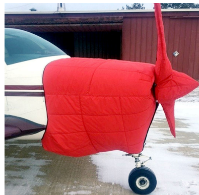
Bonanza Insulated Engine and Prop Cover