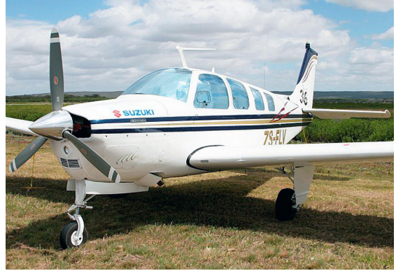
Bonanza A36 HeatShield Set