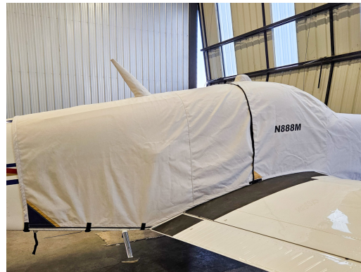
Beech Bonanza 36 Models Extended Canopy/Engine Cover, Belly Strap Type