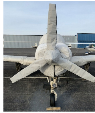
Bonanza F33A Insulated Propellor/Spinner Cover