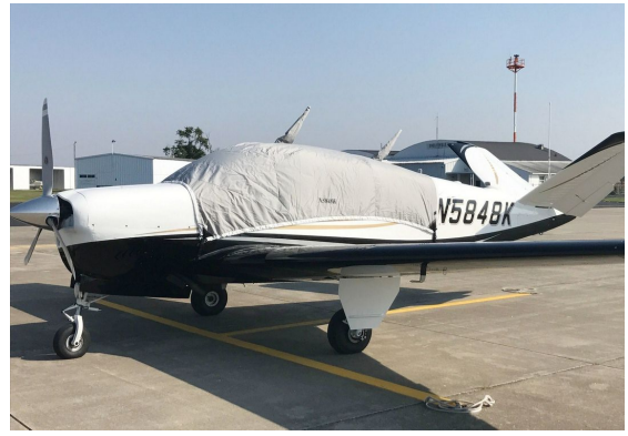
Beech Bonanza/Debonair Travel Cover, Light Weight Travel Canopy Cover