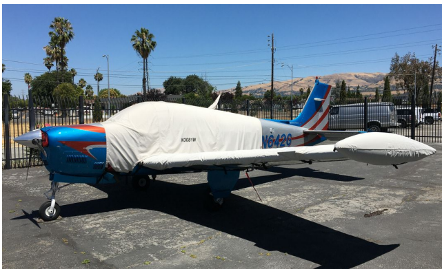
Beech Bonanza A36 Wing Covers with D'Shannon Tip Tanks, Extended Canopy Cover

WINTER USE MATERIAL - Made with Solution-Dyed Polyester fabric, this option is intended for seasonal use to aid in deicing, rain mitigation, or for occasional travel. The material is lighter and more compact, but more susceptible to UV damage and may have a shorter useful life if used continuously outside than the all-year use material.