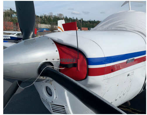
Bonanza/Debonair F33A Engine Inlet Plugs