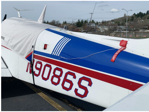
Beech Bonanza F33A Fresh Air Inlet/Exhaust Plugs