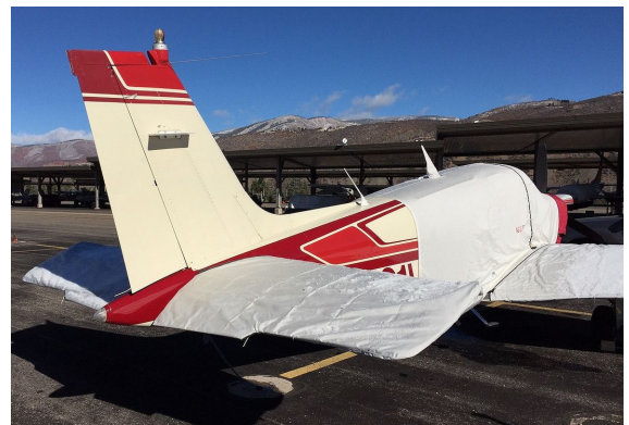
Beech Bonanza A36 Horizontal Stab, Extended Canopy, Wing Covers