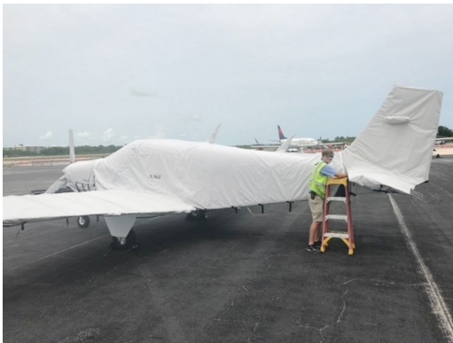
Beech Bonanza G36 Complete Cover Set

This cover type is made from Silver Acrylic Sunbrella canvas and is 100% lined with a soft and smooth microfiber. Bruce's Custom Covers developed this material combination especially for aircraft protection. The outer material is medium weight and treated for water resistance, UV resistance and anti-static buildup. The inner lining is a very soft and smooth microfiber to prevent scratching. The material is very reflective, and tests show that the cabin interior temperature can be reduced to near-ambient temperature on the hottest of days. It is water, ice and snow repellent, yet breathable to allow moisture to escape from between the cover and the aircraft surface.