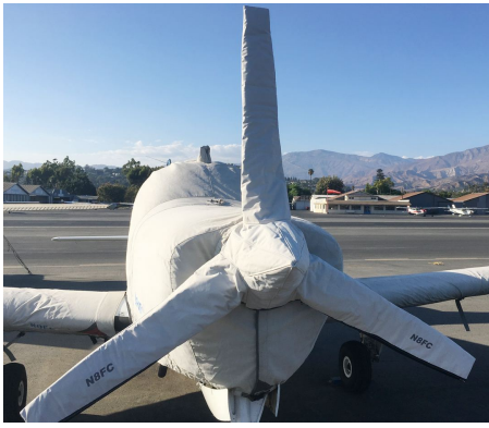
1964 Beech Bonanza Insulated Propellor/Spinner Cover