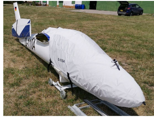
Pilatus B-4 Canopy/Nose Cover