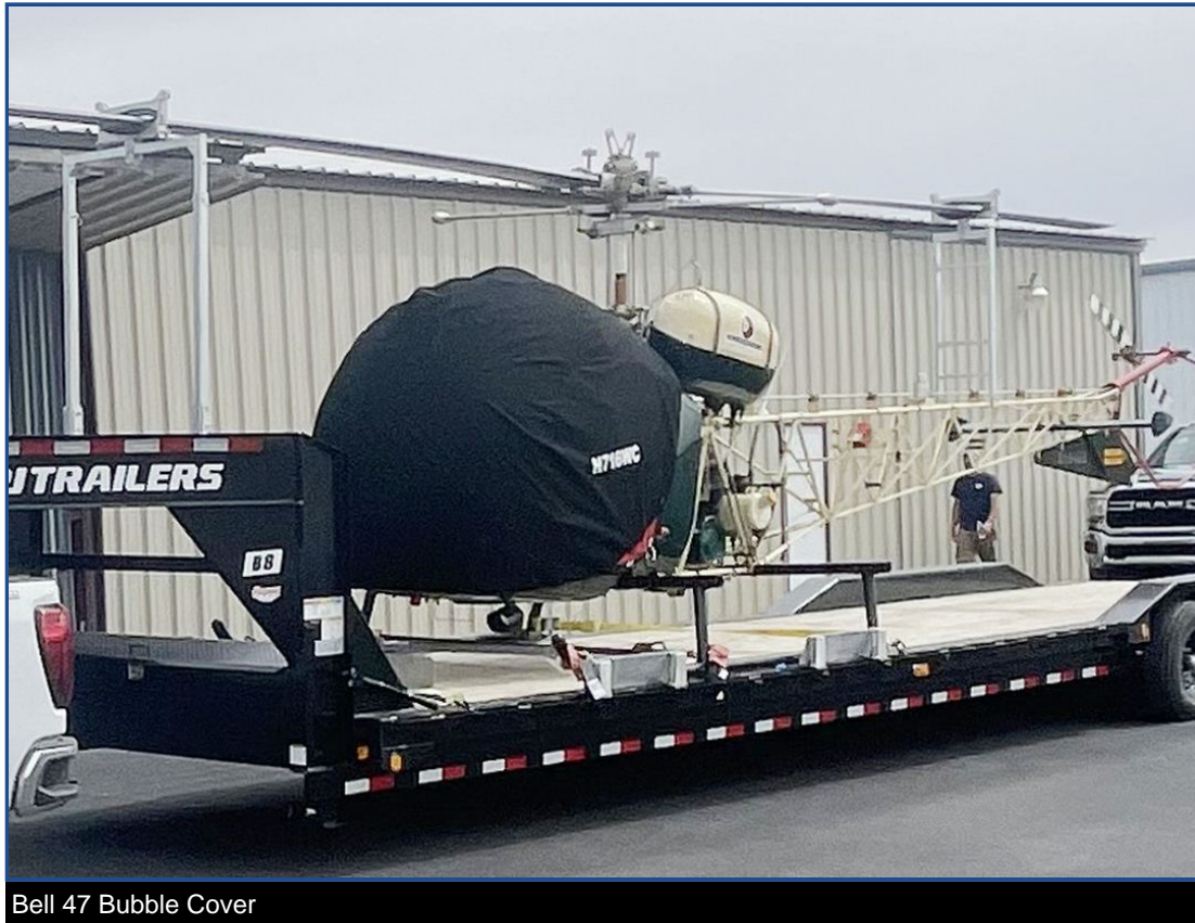
Bell 47 Bubble Cover