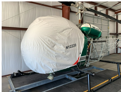
Bell 47 Bubble Cover