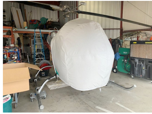
Bell 47 Bubble Cover, Narrow Cabin