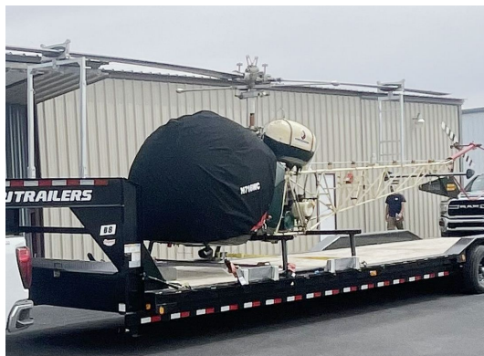
Bell 47 Bubble Cover