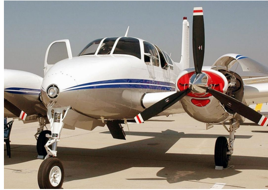
Twin Bonanza Plugs