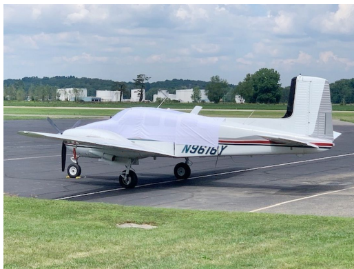
Beech Twin Bonanza Canopy/Nose Cover, test fit cover

This cover type is made from Silver Acrylic Sunbrella canvas and is 100% lined with a soft and smooth microfiber. Bruce's Custom Covers developed this material combination especially for aircraft protection. The outer material is medium weight and treated for water resistance, UV resistance and anti-static buildup. The inner lining is a very soft and smooth microfiber to prevent scratching. The material is very reflective, and tests show that the cabin interior temperature can be reduced to near-ambient temperature on the hottest of days. It is water, ice and snow repellent, yet breathable to allow moisture to escape from between the cover and the aircraft surface.