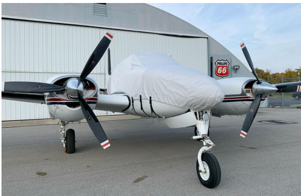
Beech Twin Bonanza Canopy/Nose Cover

This cover type is made from Silver Acrylic Sunbrella canvas and is 100% lined with a soft and smooth microfiber. Bruce's Custom Covers developed this material combination especially for aircraft protection. The outer material is medium weight and treated for water resistance, UV resistance and anti-static buildup. The inner lining is a very soft and smooth microfiber to prevent scratching. The material is very reflective, and tests show that the cabin interior temperature can be reduced to near-ambient temperature on the hottest of days. It is water, ice and snow repellent, yet breathable to allow moisture to escape from between the cover and the aircraft surface.