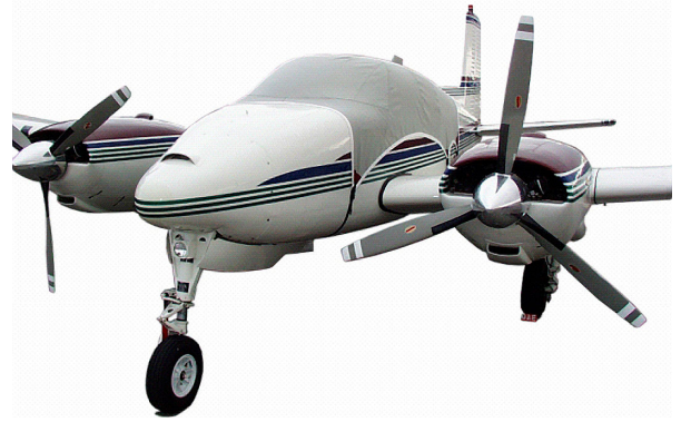
Twin Bonanza Standard Canopy Cover