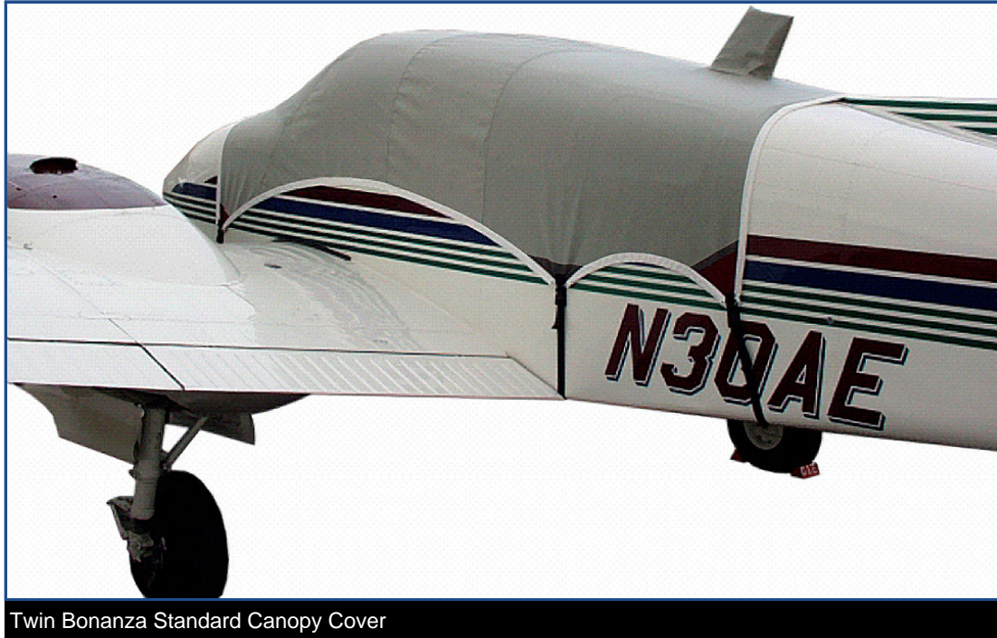
Twin Bonanza Standard Canopy Cover