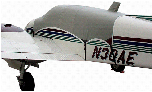
Twin Bonanza Standard Canopy Cover

Travel Covers are made with Silver Solution-Dyed Polyester fabric and only lined over the windshield to save weight. The material is lightweight and more compact for easy stowage in the aircraft. The polyester material is water resistant, but only intended for occasional use outside. We also have an ultra lightweight material available for fitted hangar dust covers. For daily outdoor use, the non-travel Sunbrella Cover is the best choice.