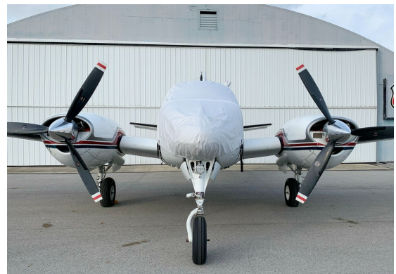
Beech Twin Bonanza Canopy/Nose Cover