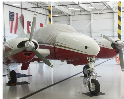
Beech Twin Bonanza D50A Canopy Cover