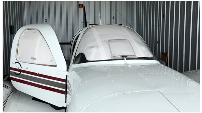
Beech Baron 58P Cockpit Heatshield Set