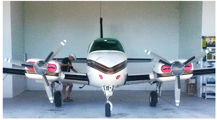
Beech Baron 58 Engine Inlet Plugs, Heater Inlet Plugs