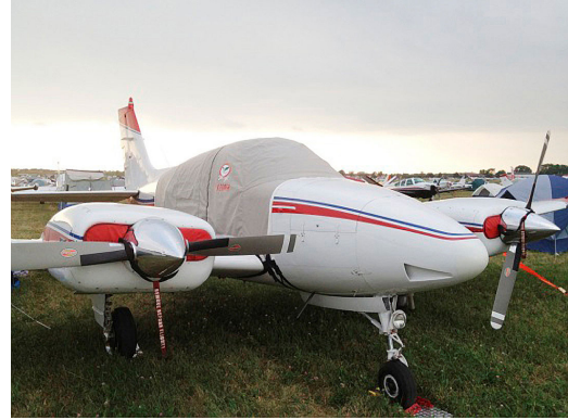
Baron 58 Canopy Cover, Engine Plugs