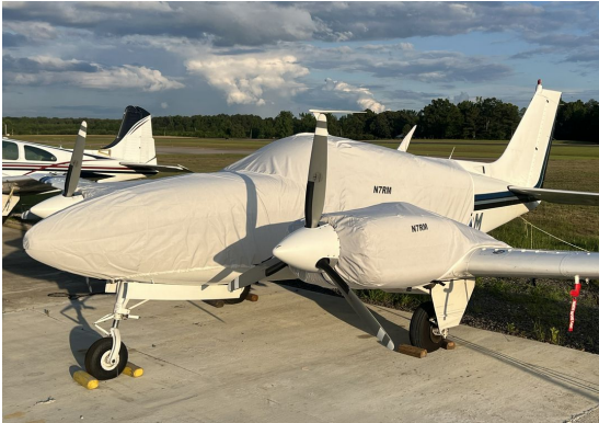
Beech C55 Baron Extended Canopy/Nose Cover, Engine Covers

This cover type is made from Silver Acrylic Sunbrella canvas and is 100% lined with a soft and smooth microfiber. Bruce's Custom Covers developed this material combination especially for aircraft protection. The outer material is medium weight and treated for water resistance, UV resistance and anti-static buildup. The inner lining is a very soft and smooth microfiber to prevent scratching. The material is very reflective, and tests show that the cabin interior temperature can be reduced to near-ambient temperature on the hottest of days. It is water, ice and snow repellent, yet breathable to allow moisture to escape from between the cover and the aircraft surface.