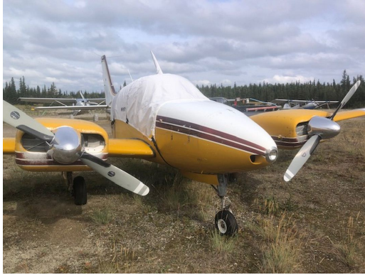
Beech A55 Baron Canopy Cover

water resistance, UV resistance and anti-static buildup. The inner lining is a very soft and smooth microfiber to prevent scratching. The material is very reflective, and tests show that the cabin interior temperature can be reduced to near-ambient temperature on the hottest of days. It is water, ice and snow repellent, yet breathable to allow moisture to escape from between the cover and the aircraft surface.