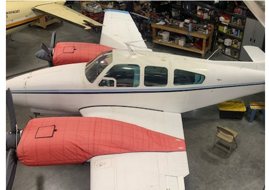
Beech Baron B55 Insulated Engine Covers