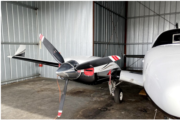
Baron 58 Engine Plugs