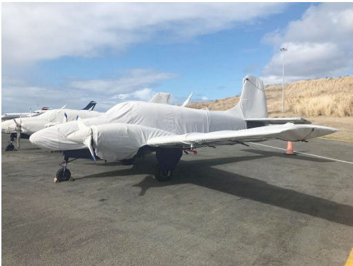
Beech Travel Air Full Cover Set

WINTER USE MATERIAL - Made with Solution-Dyed Polyester fabric, this option is intended for seasonal use to aid in deicing, rain mitigation, or for occasional travel. The material is lighter and more compact, but more susceptible to UV damage and may have a shorter useful life if used continuously outside than the all-year use material.