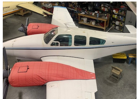
Beech Baron B55 Insulated Engine Covers