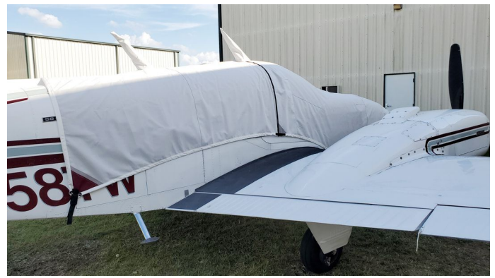
Beech Baron 58 Canopy/Nose Cover