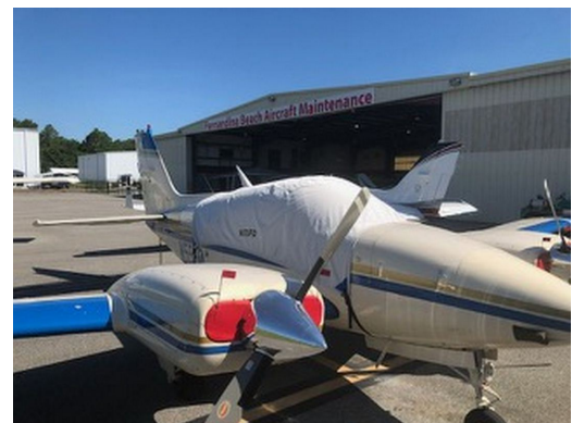
Beech Baron 95-B55 Canopy cover