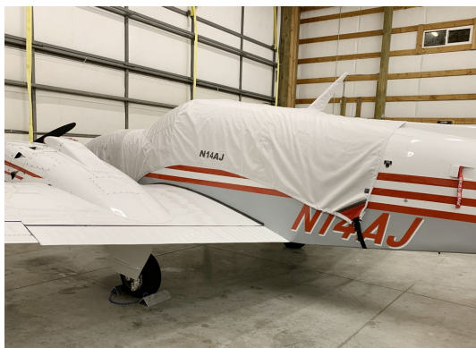
Beech Baron 58 Canopy/Nose Cover

This cover type is made from Silver Acrylic Sunbrella canvas and is 100% lined with a soft and smooth microfiber. Bruce's Custom Covers developed this material combination especially for aircraft protection. The outer material is medium weight and treated for water resistance, UV resistance and anti-static buildup. The inner lining is a very soft and smooth microfiber to prevent scratching. The material is very reflective, and tests show that the cabin interior temperature can be reduced to near-ambient temperature on the hottest of days. It is water, ice and snow repellent, yet breathable to allow moisture to escape from between the cover and the aircraft surface.