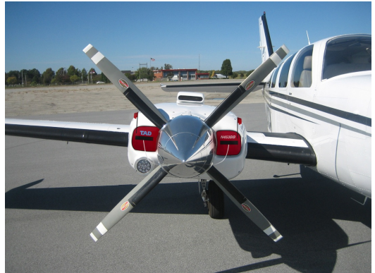
Baron 58 Engine Plugs