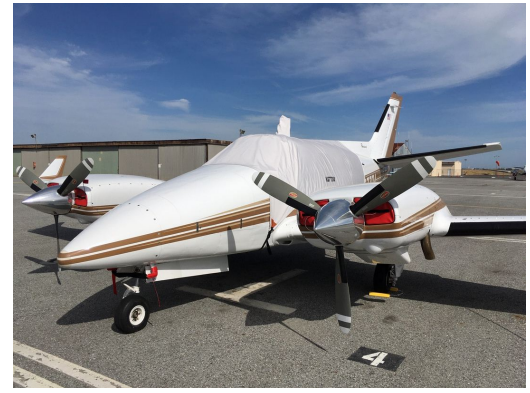
Beech Duke Canopy Cover, Engine Plugs, Pitot Covers