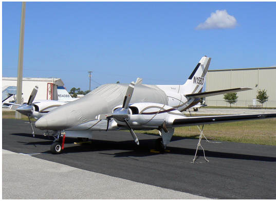
Beech Duke Canopy/Nose Cover