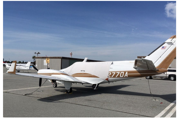
Beech Duke Canopy Cover