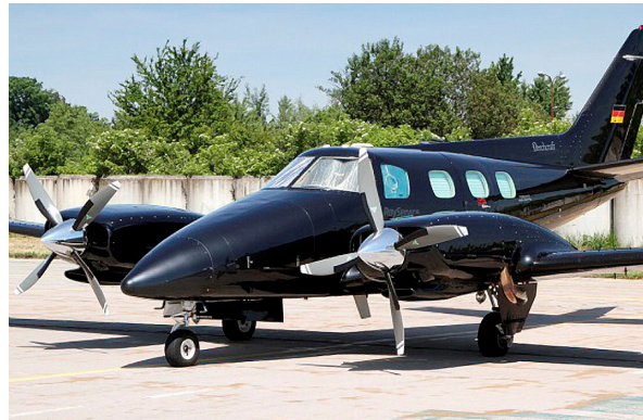
Beech Duke Cockpit HeatShields

Windshield Heatshields are interior sunshades for an aircraft's front windshield. The product is a unique composite of closed-cell foam with a silver mylar finish. The semi-rigid design is stiff enough to stand along the inside of the windshield using sun visors or window framing. It folds up flat and easily stores in the included storage sleeve. Some designs may require velcro and suction cups or split right and left sides. A Heatshield is an excellent short-term remedy for cockpit overheating. An external fabric cover is far more effective and practical for long-term protection.