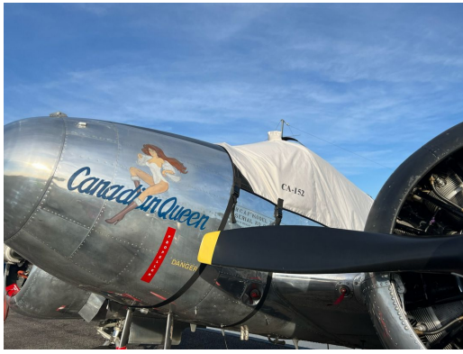
Beech B18 Cockpit Cover