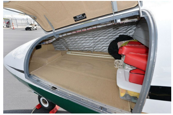
Beech Duke Engine Inlet Plugs stowed in the nose.