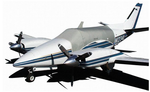
Beech Duke Standard Canopy Cover