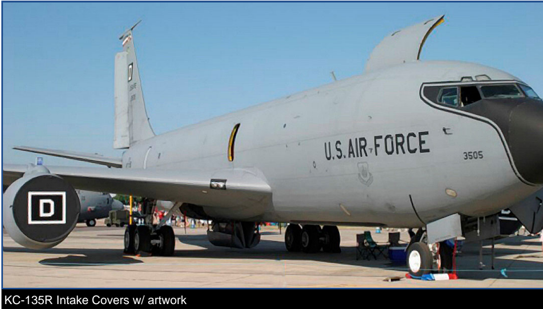
KC-135R Intake Covers w/ artwork