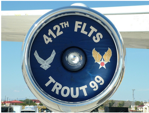
Boeing KC-135 Engine Inlet Plug, TF-33