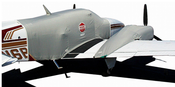
Baron Extended Canopy Cover & Engine Covers