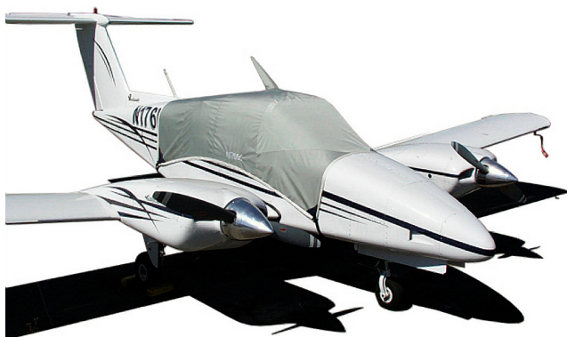
Duchess Standard Canopy Cover

This cover type is made from Silver Acrylic Sunbrella canvas and is 100% lined with a soft and smooth microfiber. Bruce's Custom Covers developed this material combination especially for aircraft protection. The outer material is medium weight and treated for water resistance, UV resistance and anti-static buildup. The inner lining is a very soft and smooth microfiber to prevent scratching. The material is very reflective, and tests show that the cabin interior temperature can be reduced to near-ambient temperature on the hottest of days. It is water, ice and snow repellent, yet breathable to allow moisture to escape from between the cover and the aircraft surface.