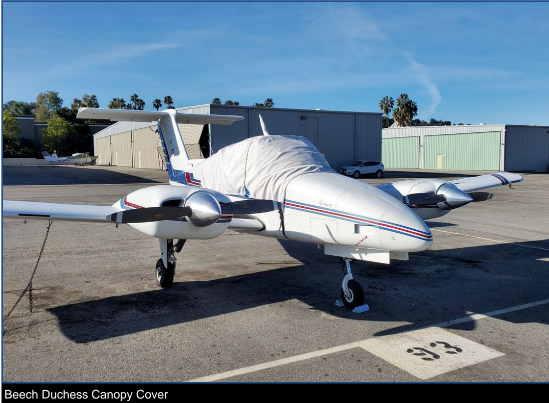
Beech Duchess Canopy Cover