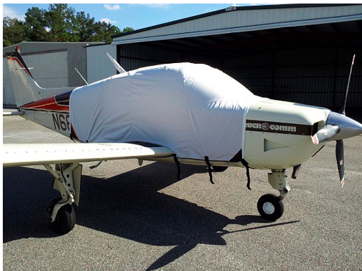
Beech Sport Extended Canopy Cover

This cover type is made from Silver Acrylic Sunbrella canvas and is 100% lined with a soft and smooth microfiber. Bruce's Custom Covers developed this material combination especially for aircraft protection. The outer material is medium weight and treated for water resistance, UV resistance and anti-static buildup. The inner lining is a very soft and smooth microfiber to prevent scratching. The material is very reflective, and tests show that the cabin interior temperature can be reduced to near-ambient temperature on the hottest of days. It is water, ice and snow repellent, yet breathable to allow moisture to escape from between the cover and the aircraft surface.