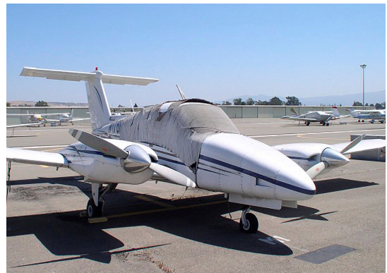
Beech Duchess Canopy Cover