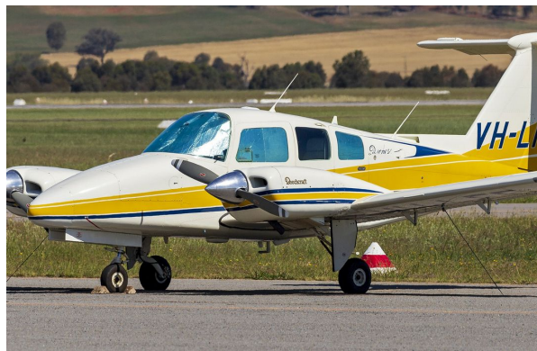
Beech Duchess B76 Heatshield Set