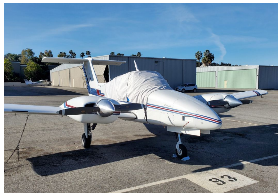
Beech Duchess Canopy Cover