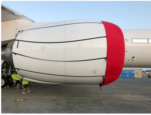
Boeing 777 Intake Covers, GE9X Engine