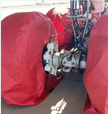
Boeing 777 Main Gear Tire Covers

ALL-YEAR USE MATERIAL - Made with Silver Acrylic Sunbrella canvas, the all-year use material is the best option for sun protection and cover longevity. This heavier more durable material is intended for all weather conditions, such as rain and snow or lots of sun.