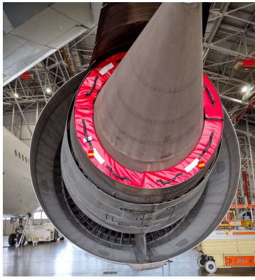
Boeing 777 Bypass Vent & Turbine Exhaust Plugs, Ge90 Engines