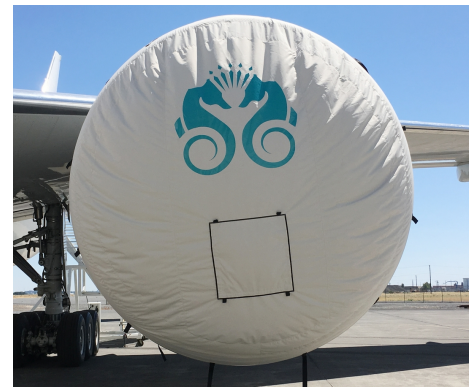
Boeing 777 Intake Covers, GE Engine