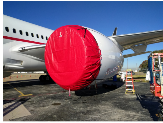
Boeing 787 Intake Cover