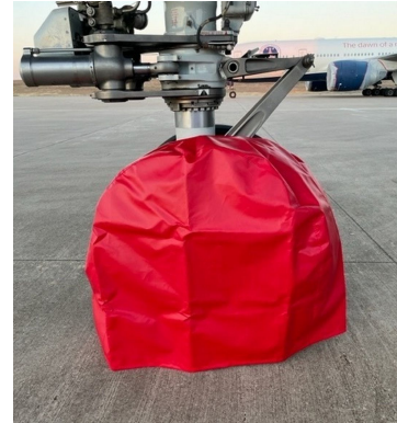
Boeing 777 Nose Gear Tire Covers