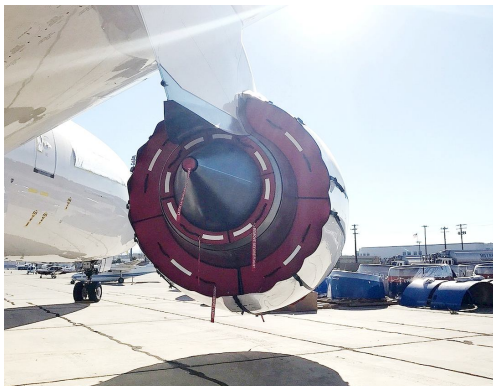
Boeing 787 Dreamliner Bypass Vent, Turbine Exhaust, & Exhaust Nozzle Plugs, Genx Engines