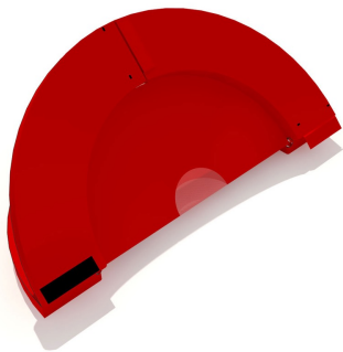
Airbus A330 Intake Plug, framed bi-fold type

The Engine Exhaust Plugs are custom fit for your Boeing 787 Dreamliner exhaust openings, made with heavy-duty vinyl material, and stuffed with a single block of sculpted urethane foam. Each plug has a zipper that allows the foam to be removed and dried if necessary. Exhaust plugs have 'remove before flight' streamers sewn onto the face of the plugs. Most plugs are imprinted with the aircraft registration number in black for an extra charge. Exhaust plugs may be inserted soon after flight when the engine is still warm. Engine Inlet Plugs are commonly referred to as Cowl Plugs, Intake Plugs, Cowl Blocks, Engine Blocks, and Engine Bungs.