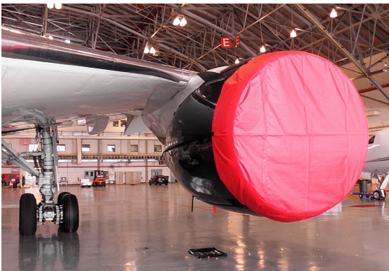
Boeing 767 Intake Covers, P/N: B767-105