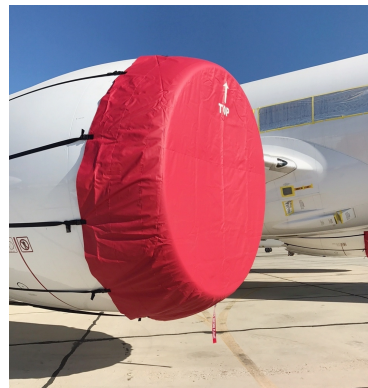
Boeing 787 Dreamliner Intake Covers Kit, Oem Type, Each, Boeing P/N: K10011-1 (Equals Qty 2 Of K10011-2), Adjustable Straps To Bypass Attachment Detail