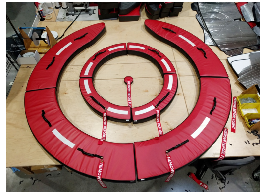
Boeing 747-8 Exhaust Plugs