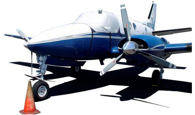
King Air Cockpit Cover, belly-strap type