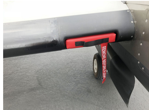
Beech King Air Heat Exchanger Inlet Plug