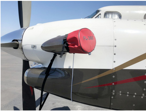
Beech King Air 350 Prop Tie-Downs/Exhaust Covers Combination

This cover type is made from Silver Acrylic Sunbrella canvas and is 100% lined with a soft and smooth microfiber. Bruce's Custom Covers developed this material combination especially for aircraft protection. The outer material is medium weight and treated for water resistance, UV resistance and anti-static buildup. The inner lining is a very soft and smooth microfiber to prevent scratching. The material is very reflective, and tests show that the cabin interior temperature can be reduced to near-ambient temperature on the hottest of days. It is water, ice and snow repellent, yet breathable to allow moisture to escape from between the cover and the aircraft surface.