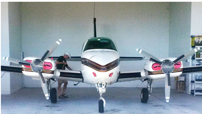
Beech Baron 58 Engine Inlet Plugs, Heater Inlet Plugs

Engine Inlet Plugs are custom fit for your Beech Travel Air B95 intakes, made with heavy-duty vinyl material, and stuffed with a single block of sculpted urethane foam. Each plug has a zipper that allows the foam to be removed and dried if necessary. Engine plugs have warning flags that are visible from the cockpit or 'remove before flight' streamers sewn onto the face of the plugs. Most plugs are imprinted with the aircraft registration number in black for an extra charge. Storage bag NOT included. Engine plugs may be inserted after flight when the engine is still warm. Engine Inlet Plugs are commonly referred to as Cowl Plugs, Intake Plugs, Cowl Blocks, Engine Blocks, and Engine Bungs.