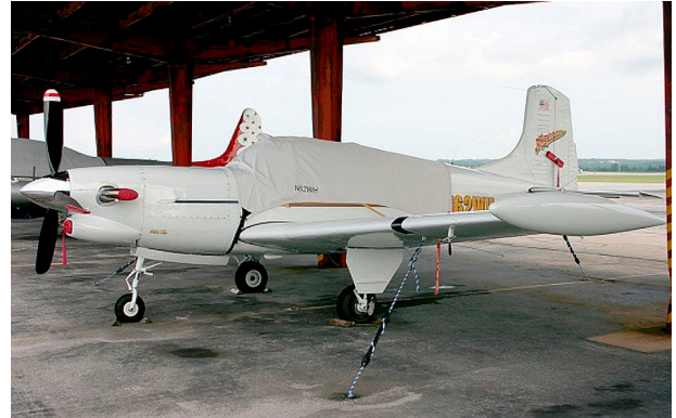
Beech B95 Travel Air Canopy Cover (Turbine Model)