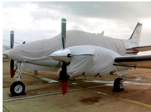
King Air C90 Canopy/Nose Cover, Engine Covers