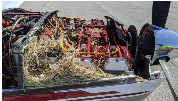
Engine and Oil Cooler Inlet Plugs ENGINE PLUGS PREVENT BIRD NEST FOD. Piper Saratoga Engine Cowling Bird's Nest