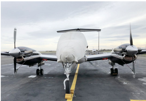
King Air 200 Canopy/Nose Cover

This cover type is made from Silver Acrylic Sunbrella canvas and is 100% lined with a soft and smooth microfiber. Bruce's Custom Covers developed this material combination especially for aircraft protection. The outer material is medium weight and treated for water resistance, UV resistance and anti-static buildup. The inner lining is a very soft and smooth microfiber to prevent scratching. The material is very reflective, and tests show that the cabin interior temperature can be reduced to near-ambient temperature on the hottest of days. It is water, ice and snow repellent, yet breathable to allow moisture to escape from between the cover and the aircraft surface.