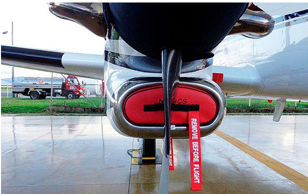
Beech King Air C90B Main Engine Inlet Plug

Engine Inlet Plugs are custom fit for your Beech 99 Airliner intakes, made with heavy-duty vinyl material, and stuffed with a single block of sculpted urethane foam. Each plug has a zipper that allows the foam to be removed and dried if necessary. Engine plugs have warning flags that are visible from the cockpit or 'remove before flight' streamers sewn onto the face of the plugs. Most plugs are imprinted with the aircraft registration number in black for an extra charge. Storage bag NOT included. Engine plugs may be inserted after flight when the engine is still warm. Engine Inlet Plugs are commonly referred to as Cowl Plugs, Intake Plugs, Cowl Blocks, Engine Blocks, and Engine Bungs.