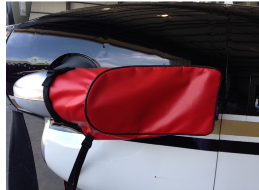
King Air Exhaust Stack Cover