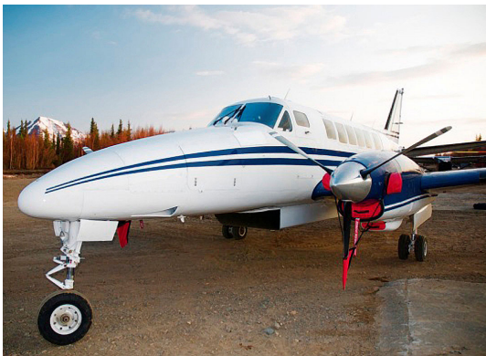
Beech 99 Engine Plugs & Prop Ties

Engine Inlet Plugs are custom fit for your Beech 99 Airliner intakes, made with heavy-duty vinyl material, and stuffed with a single block of sculpted urethane foam. Each plug has a zipper that allows the foam to be removed and dried if necessary. Engine plugs have warning flags that are visible from the cockpit or 'remove before flight' streamers sewn onto the face of the plugs. Most plugs are imprinted with the aircraft registration number in black for an extra charge. Storage bag NOT included. Engine plugs may be inserted after flight when the engine is still warm. Engine Inlet Plugs are commonly referred to as Cowl Plugs, Intake Plugs, Cowl Blocks, Engine Blocks, and Engine Bungs.