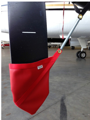
King Air Prop Tie

This cover type is made from Silver Acrylic Sunbrella canvas and is 100% lined with a soft and smooth microfiber. Bruce's Custom Covers developed this material combination especially for aircraft protection. The outer material is medium weight and treated for water resistance, UV resistance and anti-static buildup. The inner lining is a very soft and smooth microfiber to prevent scratching. The material is very reflective, and tests show that the cabin interior temperature can be reduced to near-ambient temperature on the hottest of days. It is water, ice and snow repellent, yet breathable to allow moisture to escape from between the cover and the aircraft surface.