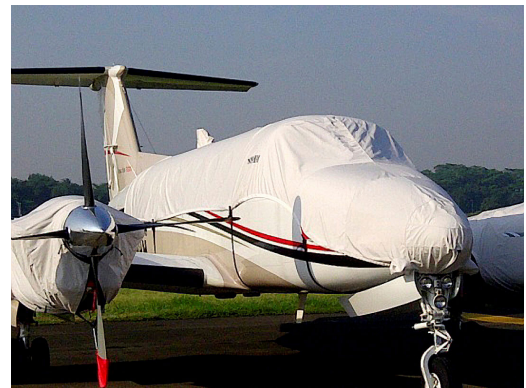
King Air 350 Canopy/Nose Cover, Engine Covers