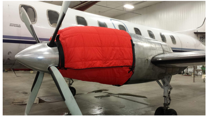
Merlin Insulated Engine Covers