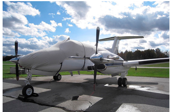
King Air B200 Canopy/Nose Cover