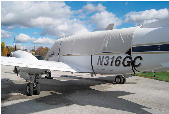
King Air Canopy/Nose cover

This cover type is made from Silver Acrylic Sunbrella canvas and is 100% lined with a soft and smooth microfiber. Bruce's Custom Covers developed this material combination especially for aircraft protection. The outer material is medium weight and treated for water resistance, UV resistance and anti-static buildup. The inner lining is a very soft and smooth microfiber to prevent scratching. The material is very reflective, and tests show that the cabin interior temperature can be reduced to near-ambient temperature on the hottest of days. It is water, ice and snow repellent, yet breathable to allow moisture to escape from between the cover and the aircraft surface.