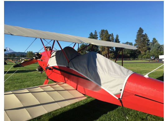
Bird BK Travel Canopy Cover