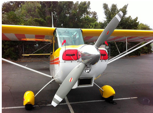
Bellanca Citabria Engine Plugs

Engine Inlet Plugs are custom fit for your Bellanca (American Champion) Citabria, Scout, Explorer intakes, made with heavy-duty vinyl material, and stuffed with a single block of sculpted urethane foam. Each plug has a zipper that allows the foam to be removed and dried if necessary. Engine plugs have warning flags that are visible from the cockpit or 'remove before flight' streamers sewn onto the face of the plugs. Most plugs are imprinted with the aircraft registration number in black for an extra charge. Storage bag NOT included. Engine plugs may be inserted after flight when the engine is still warm. Engine Inlet Plugs are commonly referred to as Cowl Plugs, Intake Plugs, Cowl Blocks, Engine Blocks, and Engine Bungs.