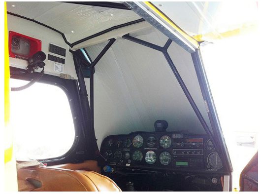
Bellanca Citabria Windshield & Skylight HeatShields