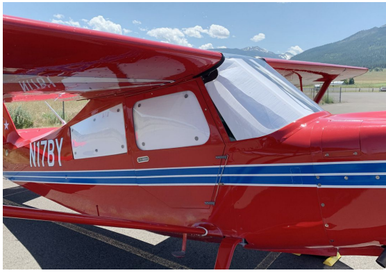
Bellanca Decathlon 8KCAB Heatshield Set with white side out