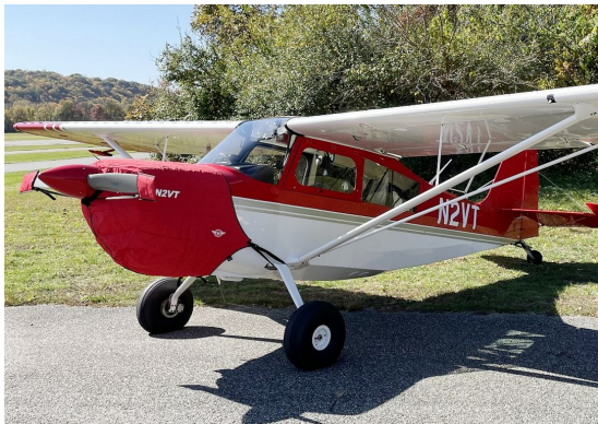
American Champion 7GCBC Insulated Engine Cover

This cover type is made from Silver Acrylic Sunbrella canvas and is 100% lined with a soft and smooth microfiber. Bruce's Custom Covers developed this material combination especially for aircraft protection. The outer material is medium weight and treated for water resistance, UV resistance and anti-static buildup. The inner lining is a very soft and smooth microfiber to prevent scratching. The material is very reflective, and tests show that the cabin interior temperature can be reduced to near-ambient temperature on the hottest of days. It is water, ice and snow repellent, yet breathable to allow moisture to escape from between the cover and the aircraft surface.