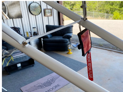
Bellanca Citabria Pitot Cover