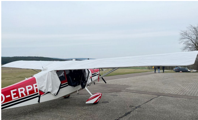
American Champion Citabria Over-Top Canopy Cover

WINTER USE MATERIAL - Made with Solution-Dyed Polyester fabric, this option is intended for seasonal use to aid in deicing, rain mitigation, or for occasional travel. The material is lighter and more compact, but more susceptible to UV damage and may have a shorter useful life if used continuously outside than the all-year use material.