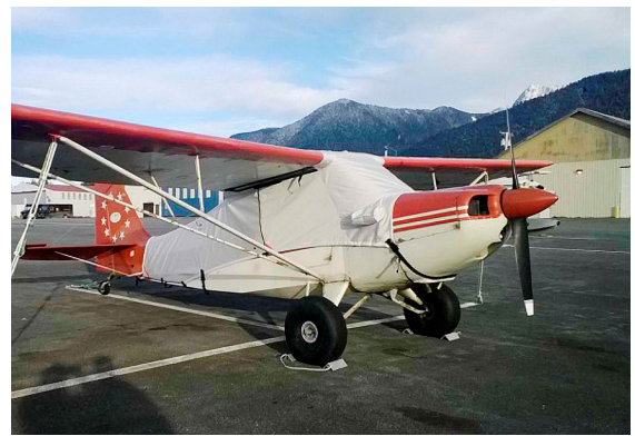
Bellanca Citabria Over-Top Canopy Cover, extended to tail