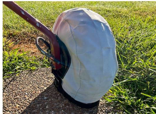
Citabria Tire Covers