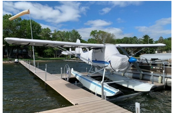
Aeronca 7GC Amphib Cover Set, AFTER