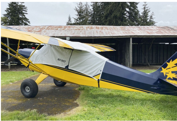
American Champion Citabria canopy cover over the top style, extends to cover gas caps