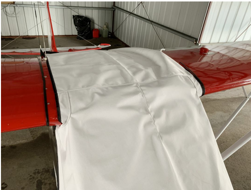
Bellanca Citabria Windshield/Skylight Cover

This cover type is made from Silver Acrylic Sunbrella canvas and is 100% lined with a soft and smooth microfiber. Bruce's Custom Covers developed this material combination especially for aircraft protection. The outer material is medium weight and treated for water resistance, UV resistance and anti-static buildup. The inner lining is a very soft and smooth microfiber to prevent scratching. The material is very reflective, and tests show that the cabin interior temperature can be reduced to near-ambient temperature on the hottest of days. It is water, ice and snow repellent, yet breathable to allow moisture to escape from between the cover and the aircraft surface.