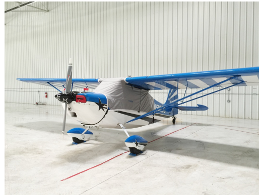
Bellanca Citabria Light Weight Travel Cover, Engine Plugs