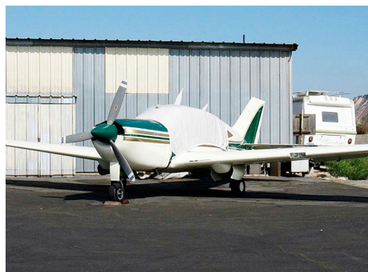
Bellanca Viking Canopy Cover