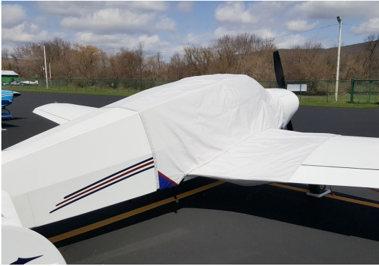
Bellanca Cruisemaster Extended Canopy Cover with 36" Wing Extensions.

This cover type is made from Silver Acrylic Sunbrella canvas and is 100% lined with a soft and smooth microfiber. Bruce's Custom Covers developed this material combination especially for aircraft protection. The outer material is medium weight and treated for water resistance, UV resistance and anti-static buildup. The inner lining is a very soft and smooth microfiber to prevent scratching. The material is very reflective, and tests show that the cabin interior temperature can be reduced to near-ambient temperature on the hottest of days. It is water, ice and snow repellent, yet breathable to allow moisture to escape from between the cover and the aircraft surface.