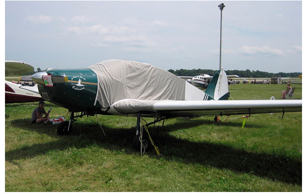
Extended Canopy Cover with Wing Extensions