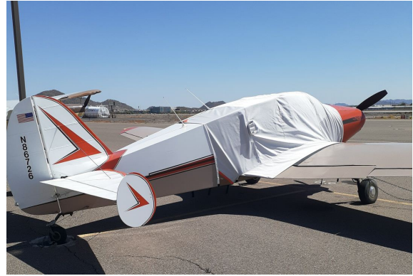
Bellanca 14-13 Cruisair Extended Canopy Cover w/12" Wing Extensions