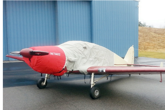
Bellanca Cruisemaster Insulated Engine Cover