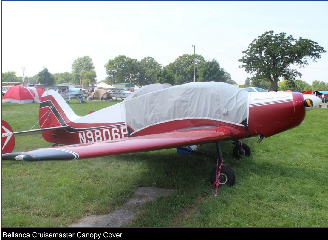
Bellanca Cruisemaster Canopy Cover