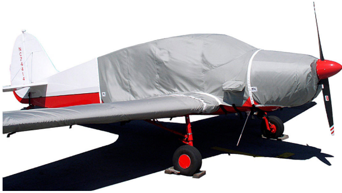
Extended Canopy Cover w/12" Wing Extensions, Engine & Wing Covers

This cover type is made from Silver Acrylic Sunbrella canvas and is 100% lined with a soft and smooth microfiber. Bruce's Custom Covers developed this material combination especially for aircraft protection. The outer material is medium weight and treated for water resistance, UV resistance and anti-static buildup. The inner lining is a very soft and smooth microfiber to prevent scratching. The material is very reflective, and tests show that the cabin interior temperature can be reduced to near-ambient temperature on the hottest of days. It is water, ice and snow repellent, yet breathable to allow moisture to escape from between the cover and the aircraft surface.