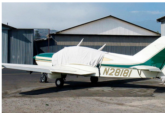
Bellanca Viking Canopy Cover

Travel Covers are made with Silver Solution-Dyed Polyester fabric and only lined over the windshield to save weight. The material is lightweight and more compact for easy stowage in the aircraft. The polyester material is water resistant, but only intended for occasional use outside. We also have an ultra lightweight material available for fitted hangar dust covers. For daily outdoor use, the non-travel Sunbrella Cover is the best choice.