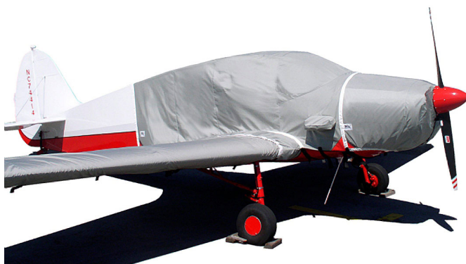
Bellanca Cruisemaster Insulated Engine Cover