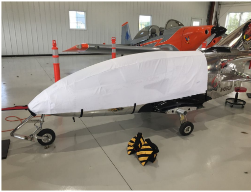
Bede BD-5 Canopy/Nose Cover, test fit cover