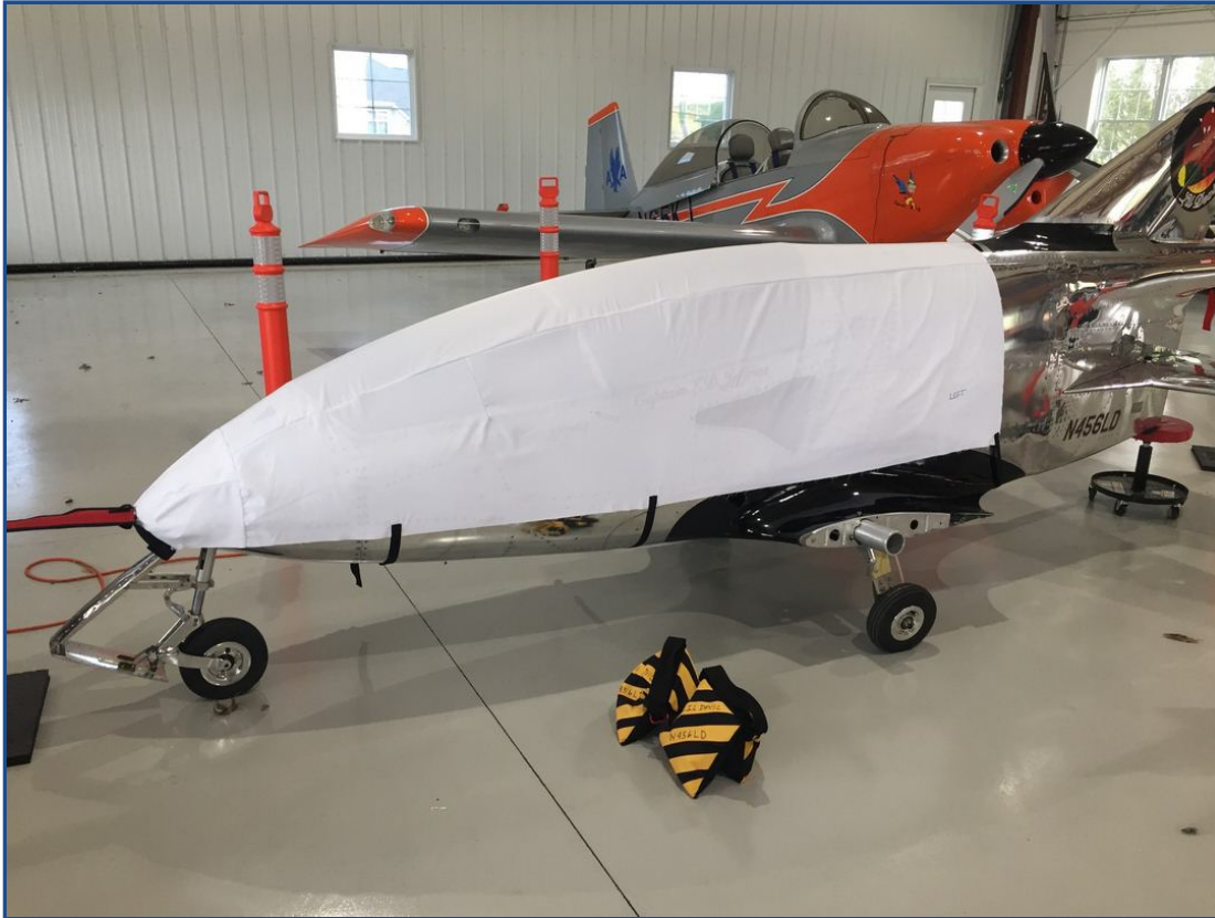
Bede BD-5 Canopy/Nose Cover, test fit cover