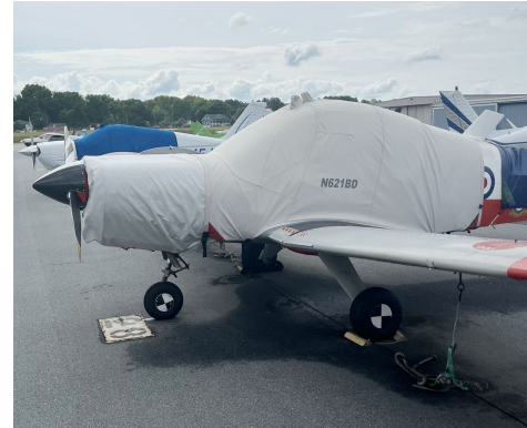
Scottish Aviation Bulldog Canopy & Engine Covers