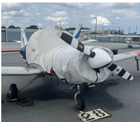
Scottish Aviation Bulldog Canopy & Engine Covers

This cover type is made from Silver Acrylic Sunbrella canvas and is 100% lined with a soft and smooth microfiber. Bruce's Custom Covers developed this material combination especially for aircraft protection. The outer material is medium weight and treated for water resistance, UV resistance and anti-static buildup. The inner lining is a very soft and smooth microfiber to prevent scratching. The material is very reflective, and tests show that the cabin interior temperature can be reduced to near-ambient temperature on the hottest of days. It is water, ice and snow repellent, yet breathable to allow moisture to escape from between the cover and the aircraft surface.