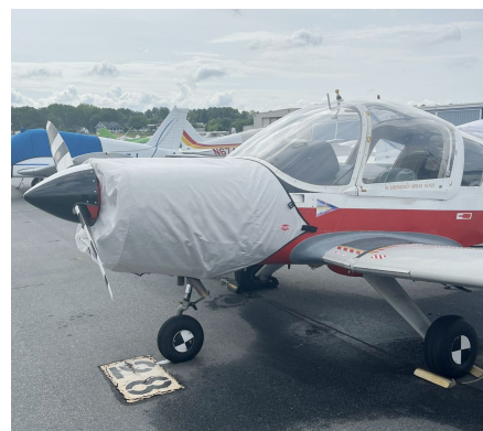
Scottish Aviation Bulldog Engine Cover