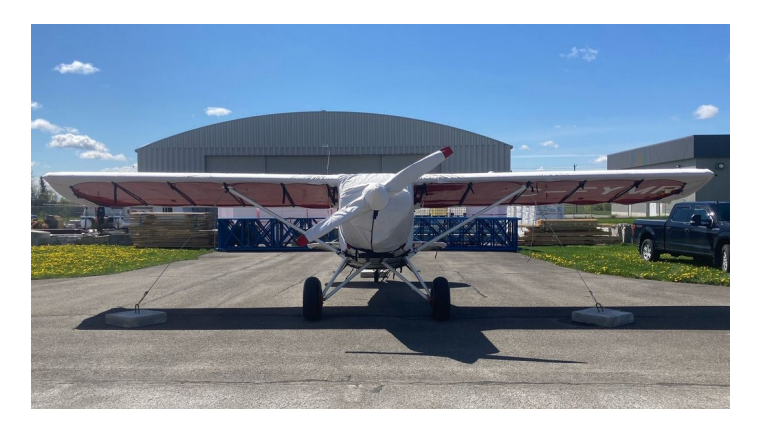
Bearhawk 4-Place Complete Cover Set

WINTER USE MATERIAL - Made with Solution-Dyed Polyester fabric, this option is intended for seasonal use to aid in deicing, rain mitigation, or for occasional travel. The material is lighter and more compact, but more susceptible to UV damage and may have a shorter useful life if used continuously outside than the all-year use material.