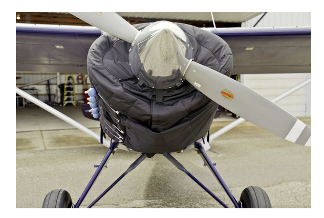
Bearhawk Insulated Engine Cover

This cover type is made from Silver Acrylic Sunbrella canvas and is 100% lined with a soft and smooth microfiber. Bruce's Custom Covers developed this material combination especially for aircraft protection. The outer material is medium weight and treated for water resistance, UV resistance and anti-static buildup. The inner lining is a very soft and smooth microfiber to prevent scratching. The material is very reflective, and tests show that the cabin interior temperature can be reduced to near-ambient temperature on the hottest of days. It is water, ice and snow repellent, yet breathable to allow moisture to escape from between the cover and the aircraft surface.