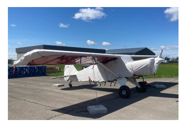
Bearhawk 4-Place Complete Cover Set, AFTER