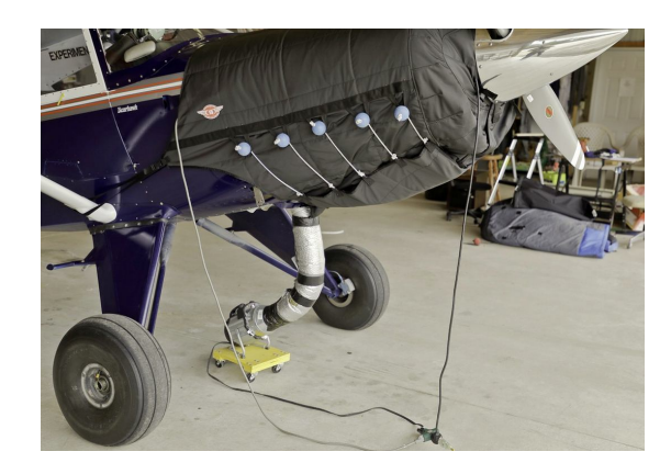
Bearhawk Insulated Engine Cover