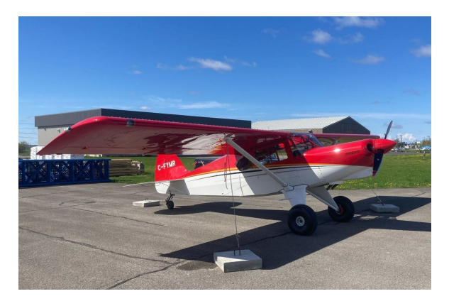
Bearhawk 4-Place Complete Cover Set, BEFORE

This cover type is made from Silver Acrylic Sunbrella canvas and is 100% lined with a soft and smooth microfiber. Bruce's Custom Covers developed this material combination especially for aircraft protection. The outer material is medium weight and treated for water resistance, UV resistance and anti-static buildup. The inner lining is a very soft and smooth microfiber to prevent scratching. The material is very reflective, and tests show that the cabin interior temperature can be reduced to near-ambient temperature on the hottest of days. It is water, ice and snow repellent, yet breathable to allow moisture to escape from between the cover and the aircraft surface.