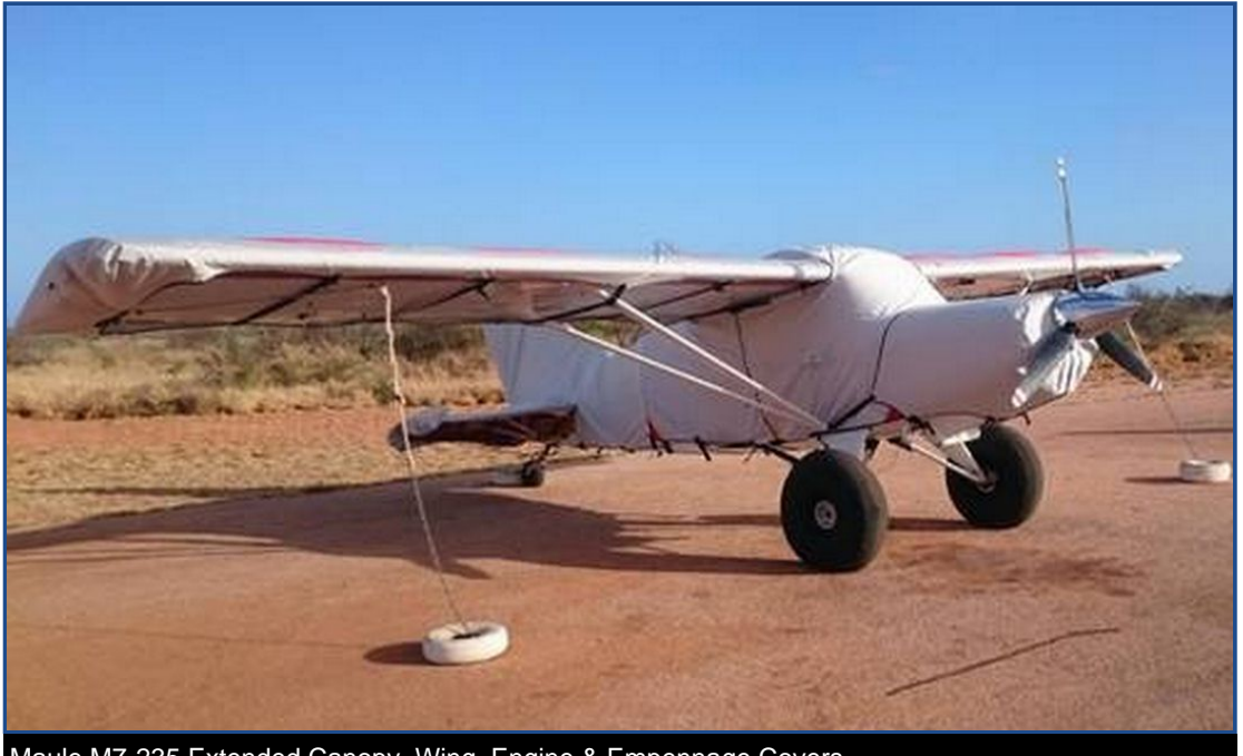
Maule M7-235 Extended Canopy, Wing, Engine & Empennage Covers