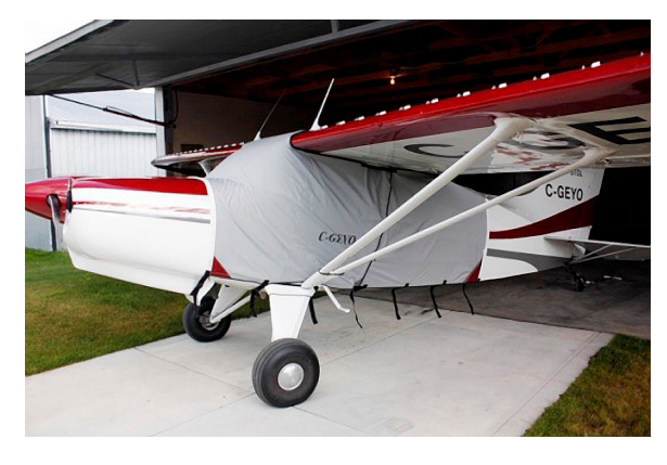
Maule Over-Top Extended Canopy Cover