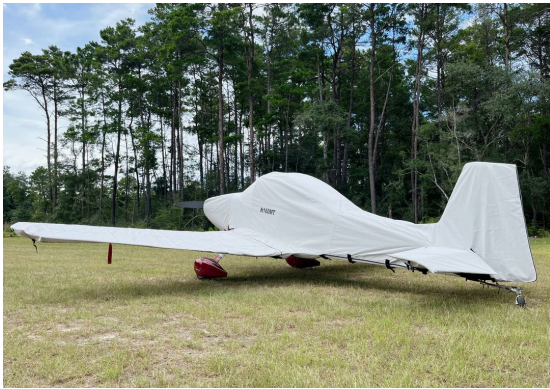
Bushby Mustang Complete Fuselage Cover with Detachable Wing Covers

This cover type is made from Silver Acrylic Sunbrella canvas and is 100% lined with a soft and smooth microfiber. Bruce's Custom Covers developed this material combination especially for aircraft protection. The outer material is medium weight and treated for water resistance, UV resistance and anti-static buildup. The inner lining is a very soft and smooth microfiber to prevent scratching. The material is very reflective, and tests show that the cabin interior temperature can be reduced to near-ambient temperature on the hottest of days. It is water, ice and snow repellent, yet breathable to allow moisture to escape from between the cover and the aircraft surface.