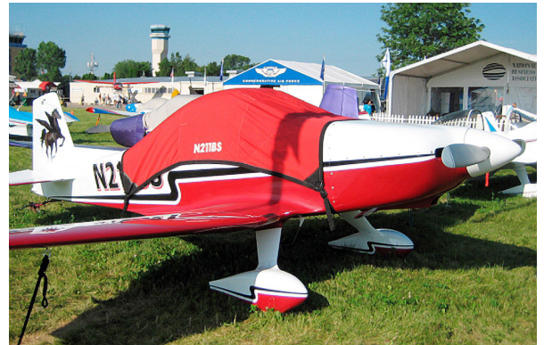
Bushby Mustang Canopy Cover