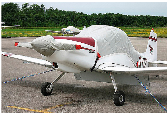
Bushby Mustang Canopy cover and Propellor/Spinner cover