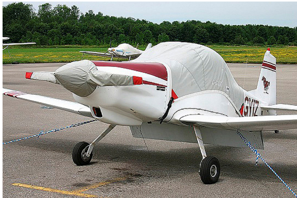
Bushby Mustang Canopy cover and Propellor/Spinner cover

Travel Covers are made with Silver Solution-Dyed Polyester fabric and only lined over the windshield to save weight. The material is lightweight and more compact for easy stowage in the aircraft. The polyester material is water resistant, but only intended for occasional use outside. We also have an ultra lightweight material available for fitted hangar dust covers. For daily outdoor use, the non-travel Sunbrella Cover is the best choice.