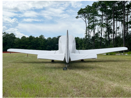
Bushby Mustang Complete Fuselage Cover with Detachable Wing Covers