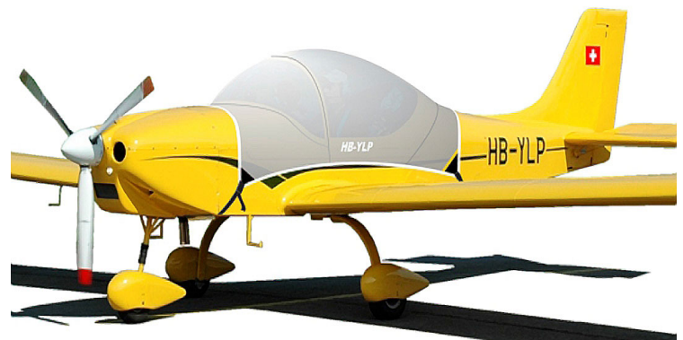
Ikarus Breezer Canopy Cover (illustration)