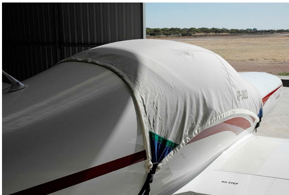
Pulsar Canopy Cover

This cover type is made from Silver Acrylic Sunbrella canvas and is 100% lined with a soft and smooth microfiber. Bruce's Custom Covers developed this material combination especially for aircraft protection. The outer material is medium weight and treated for water resistance, UV resistance and anti-static buildup. The inner lining is a very soft and smooth microfiber to prevent scratching. The material is very reflective, and tests show that the cabin interior temperature can be reduced to near-ambient temperature on the hottest of days. It is water, ice and snow repellent, yet breathable to allow moisture to escape from between the cover and the aircraft surface.