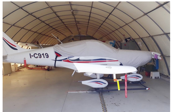
BRM Aero Bristell S-LSA Canopy/Engine Cover