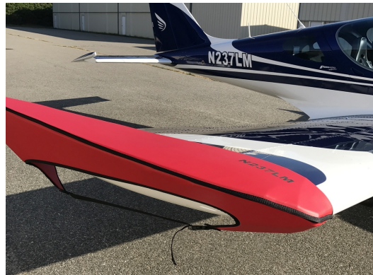
BRM Aero Bristell S-LSA Wingtip Pads

Designed to prevent damage to the aircraft extremities in crowded hangars, these products are made of bright red Naugahyde and thickly padded with a sandwich of closed cell foam.