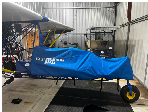
Breezy RLU-1 Forward Fuselage Enclosure