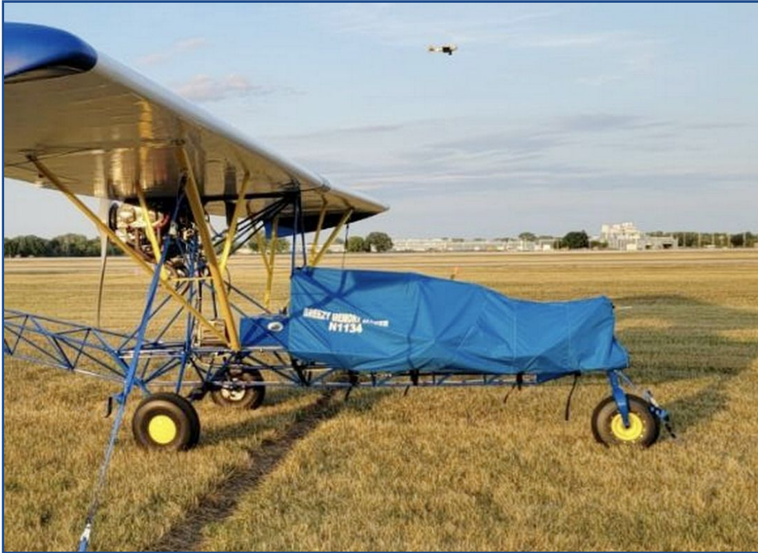
Breezy Forward Fuselage Enclosure