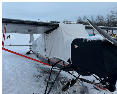
Bushmaster Canopy & Insulated Engine Covers