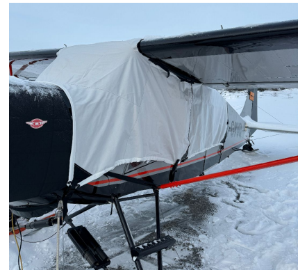
Bushmaster Canopy & Insulated Engine Covers