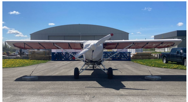
Bearhawk 4-Place Complete Cover Set