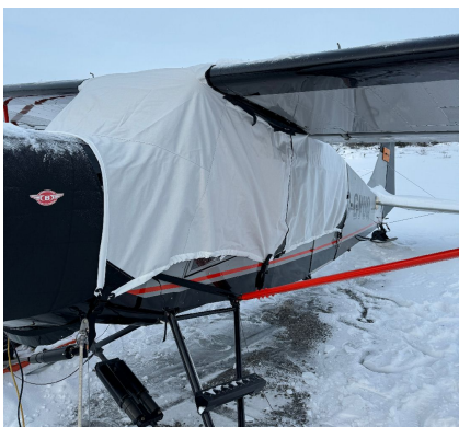
Bushmaster Canopy & Insulated Engine Covers

WINTER USE MATERIAL - Made with Solution-Dyed Polyester fabric, this option is intended for seasonal use to aid in deicing, rain mitigation, or for occasional travel. The material is lighter and more compact, but more susceptible to UV damage and may have a shorter useful life if used continuously outside than the all-year use material.