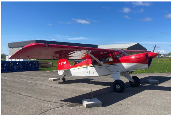
Bearhawk 4-Place Complete Cover Set, BEFORE

This cover type is made from Silver Acrylic Sunbrella canvas and is 100% lined with a soft and smooth microfiber. Bruce's Custom Covers developed this material combination especially for aircraft protection. The outer material is medium weight and treated for water resistance, UV resistance and anti-static buildup. The inner lining is a very soft and smooth microfiber to prevent scratching. The material is very reflective, and tests show that the cabin interior temperature can be reduced to near-ambient temperature on the hottest of days. It is water, ice and snow repellent, yet breathable to allow moisture to escape from between the cover and the aircraft surface.