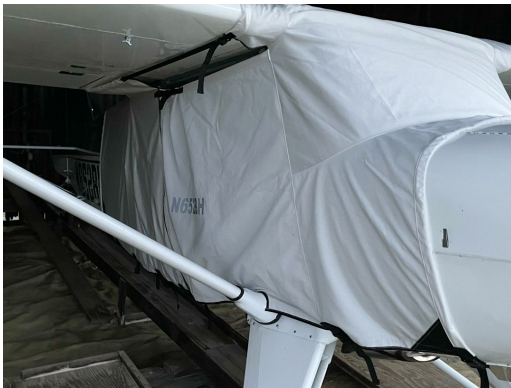
Avipro Bearhawk Extended Over The Top Canopy Cover

This cover type is made from Silver Acrylic Sunbrella canvas and is 100% lined with a soft and smooth microfiber. Bruce's Custom Covers developed this material combination especially for aircraft protection. The outer material is medium weight and treated for water resistance, UV resistance and anti-static buildup. The inner lining is a very soft and smooth microfiber to prevent scratching. The material is very reflective, and tests show that the cabin interior temperature can be reduced to near-ambient temperature on the hottest of days. It is water, ice and snow repellent, yet breathable to allow moisture to escape from between the cover and the aircraft surface.