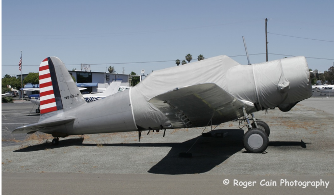
BT-13 Extended Canopy & Engine Covers

This cover type is made from Silver Acrylic Sunbrella canvas and is 100% lined with a soft and smooth microfiber. Bruce's Custom Covers developed this material combination especially for aircraft protection. The outer material is medium weight and treated for water resistance, UV resistance and anti-static buildup. The inner lining is a very soft and smooth microfiber to prevent scratching. The material is very reflective, and tests show that the cabin interior temperature can be reduced to near-ambient temperature on the hottest of days. It is water, ice and snow repellent, yet breathable to allow moisture to escape from between the cover and the aircraft surface.