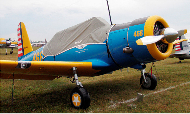
BT-13 Canopy Cover

non-travel Sunbrella Cover is the best choice.