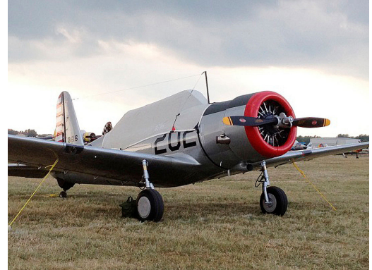
BT-13 Canopy Cover