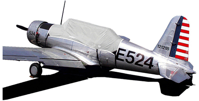
BT-13 Canopy Cover