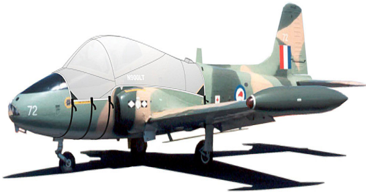
Jet Provost Canopy Cover (Illustration)

Travel Covers are made with Silver Solution-Dyed Polyester fabric and only lined over the windshield to save weight. The material is lightweight and more compact for easy stowage in the aircraft. The polyester material is water resistant, but only intended for occasional use outside. We also have an ultra lightweight material available for fitted hangar dust covers. For daily outdoor use, the non-travel Sunbrella Cover is the best choice.