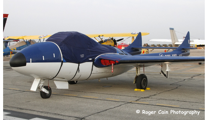
DeHavilland Vampire Canopy Cover, Engine Plugs