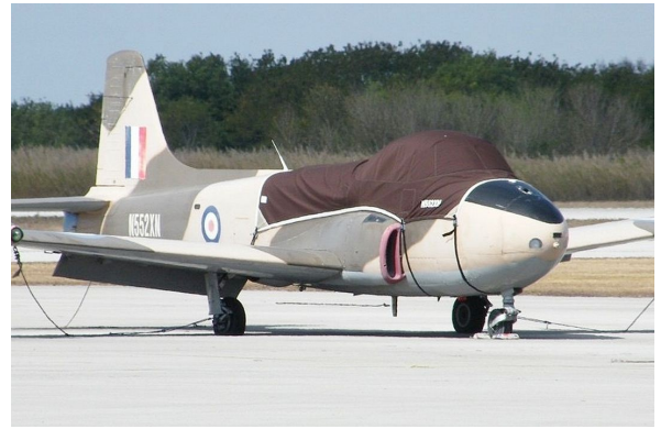
Jet Provost Canopy Cover