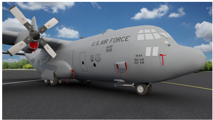
C-130 Engine Plugs (illustration)