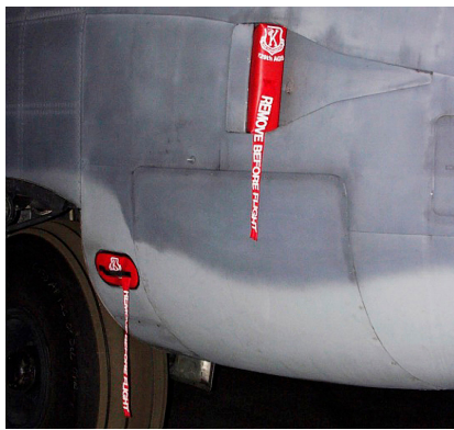
C-130 Heat Exchanger & Exhaust Plugs