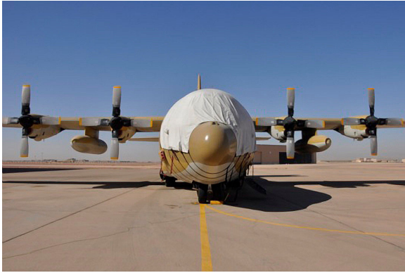
C-130 Cockpit Cover (Windshield/Flight Deck)

escape from between the cover and the aircraft surface.