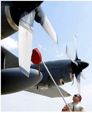
C-130 Inlet Plugs (and the clever gentleman installing the plug)