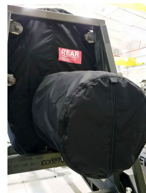
C-130 QEC / Maintenance Cover Set