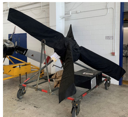
Lockheed C-130 Prop Cover, without spinner