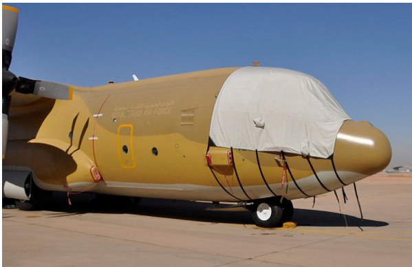
C-130 Cockpit Cover (Windshield/Flight Deck)

This cover type is made from Silver Acrylic Sunbrella canvas and is 100% lined with a soft and smooth microfiber. Bruce's Custom Covers developed this material combination especially for aircraft protection. The outer material is medium weight and treated for water resistance, UV resistance and anti-static buildup. The inner lining is a very soft and smooth microfiber to prevent scratching. The material is very reflective, and tests show that the cabin interior temperature can be reduced to near-ambient temperature on the hottest of days. It is water, ice and snow repellent, yet breathable to allow moisture to escape from between the cover and the aircraft surface.