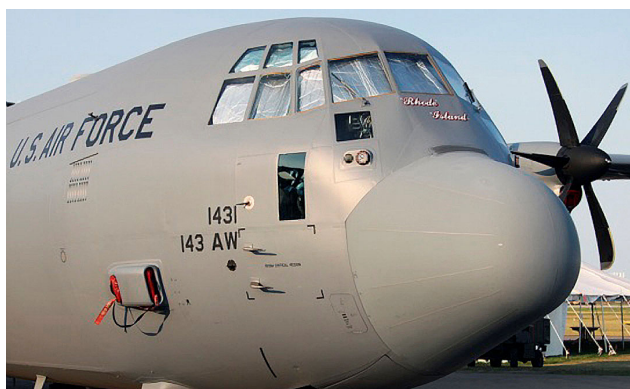
C-130 Cockpit HeatShields

Windshield and Skylight Heatshields are interior sunshades for an aircraft's front windshield and overhead window. The product is a unique composite of closed-cell foam with a silver mylar finish. The semi-rigid design is stiff enough to stand along the inside of the windshield using sun visors or window framing. It folds up flat and easily stores in the included storage sleeve. Some designs may require velcro and suction cups or split right and left sides. A Heatshield is an excellent short-term remedy for cockpit overheating. An external fabric cover is far more effective and practical for long-term protection.