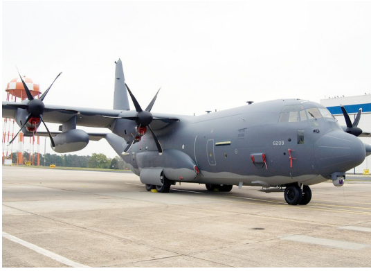
Various plugs and covers for MC-130J(Pitot Covers, Air Conditioning Plugs, Engine Plugs)