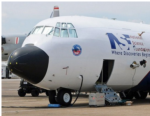
Lockheed C-130 Flight Deck HeatShield Set

Windshield and Skylight Heatshields are interior sunshades for an aircraft's front windshield and overhead window. The product is a unique composite of closed-cell foam with a silver mylar finish. The semi-rigid design is stiff enough to stand along the inside of the windshield using sun visors or window framing. It folds up flat and easily stores in the included storage sleeve. Some designs may require velcro and suction cups or split right and left sides. A Heatshield is an excellent short-term remedy for cockpit overheating. An external fabric cover is far more effective and practical for long-term protection.