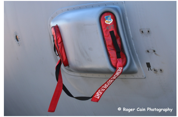
Lockheed C-130 Flight Deck Inlet/Exhaust Plugs