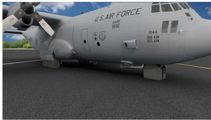
C-130 Tire Covers