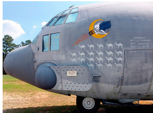
Lockheed AC-130A Flight Deck HeatShield Set