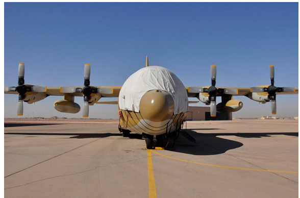
C-130 Cockpit Cover (Windshield/Flight Deck)