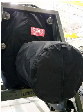
C-130 QEC / Maintenance Cover Set

This cover type is made from Silver Acrylic Sunbrella canvas and is 100% lined with a soft and smooth microfiber. Bruce's Custom Covers developed this material combination especially for aircraft protection. The outer material is medium weight and treated for water resistance, UV resistance and anti-static buildup. The inner lining is a very soft and smooth microfiber to prevent scratching. The material is very reflective, and tests show that the cabin interior temperature can be reduced to near-ambient temperature on the hottest of days. It is water, ice and snow repellent, yet breathable to allow moisture to escape from between the cover and the aircraft surface.