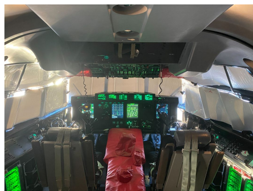
Lockheed C-130 Hercules Flight Deck Heatshield Set