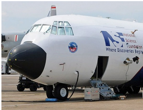
Lockheed C-130 Flight Deck HeatShield Set

Windshield and Skylight Heatshields are interior sunshades for an aircraft's front windshield and overhead window. The product is a unique composite of closed-cell foam with a silver mylar finish. The semi-rigid design is stiff enough to stand along the inside of the windshield using sun visors or window framing. It folds up flat and easily stores in the included storage sleeve. Some designs may require velcro and suction cups or split right and left sides. A Heatshield is an excellent short-term remedy for cockpit overheating. An external fabric cover is far more effective and practical for long-term protection.