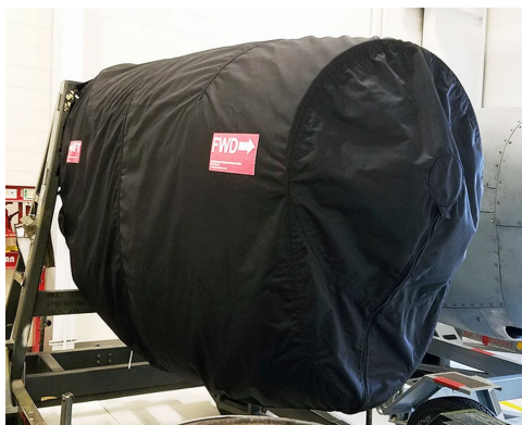
C-130 QEC / Maintenance Cover Set

This cover type is made from Silver Acrylic Sunbrella canvas and is 100% lined with a soft and smooth microfiber. Bruce's Custom Covers developed this material combination especially for aircraft protection. The outer material is medium weight and treated for water resistance, UV resistance and anti-static buildup. The inner lining is a very soft and smooth microfiber to prevent scratching. The material is very reflective, and tests show that the cabin interior temperature can be reduced to near-ambient temperature on the hottest of days. It is water, ice and snow repellent, yet breathable to allow moisture to escape from between the cover and the aircraft surface.