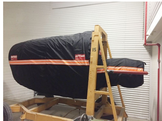
C-130 QEC / Maintenance Cover Set