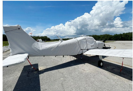
Beech Musketeer A23 Cover Set