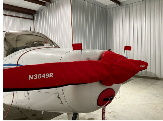
Beech A23 Musketeer Insulated Prop Cover, Engine Plugs