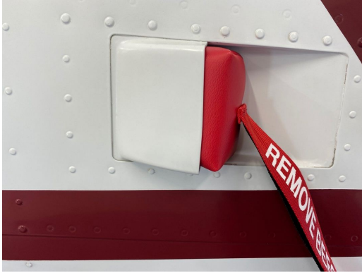
Beech Bonanza A36 Fresh Air Inlet/Exhaust Plug Set

plugs have warning flags that are visible from the cockpit or 'remove before flight' streamers sewn onto the face of the plugs. Most plugs are imprinted with the aircraft registration number in black for an extra charge. Storage bag NOT included. Engine plugs may be inserted after flight when the engine is still warm. Engine Inlet Plugs are commonly referred to as Cowl Plugs, Intake Plugs, Cowl Blocks, Engine Blocks, and Engine Bungs.