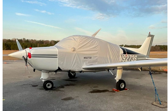
Beech Sundowner Extended Canopy Cover