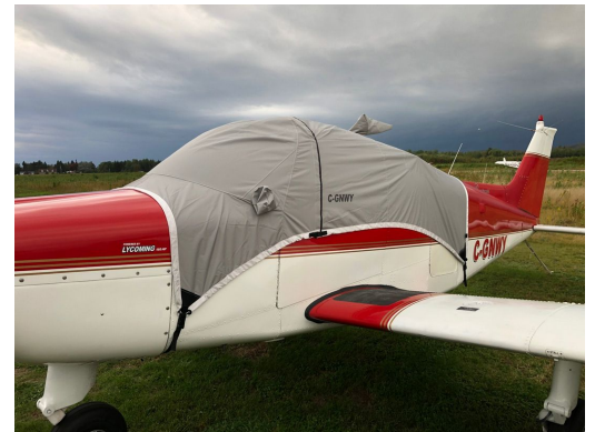
Beech Sundowner Travel Canopy Cover