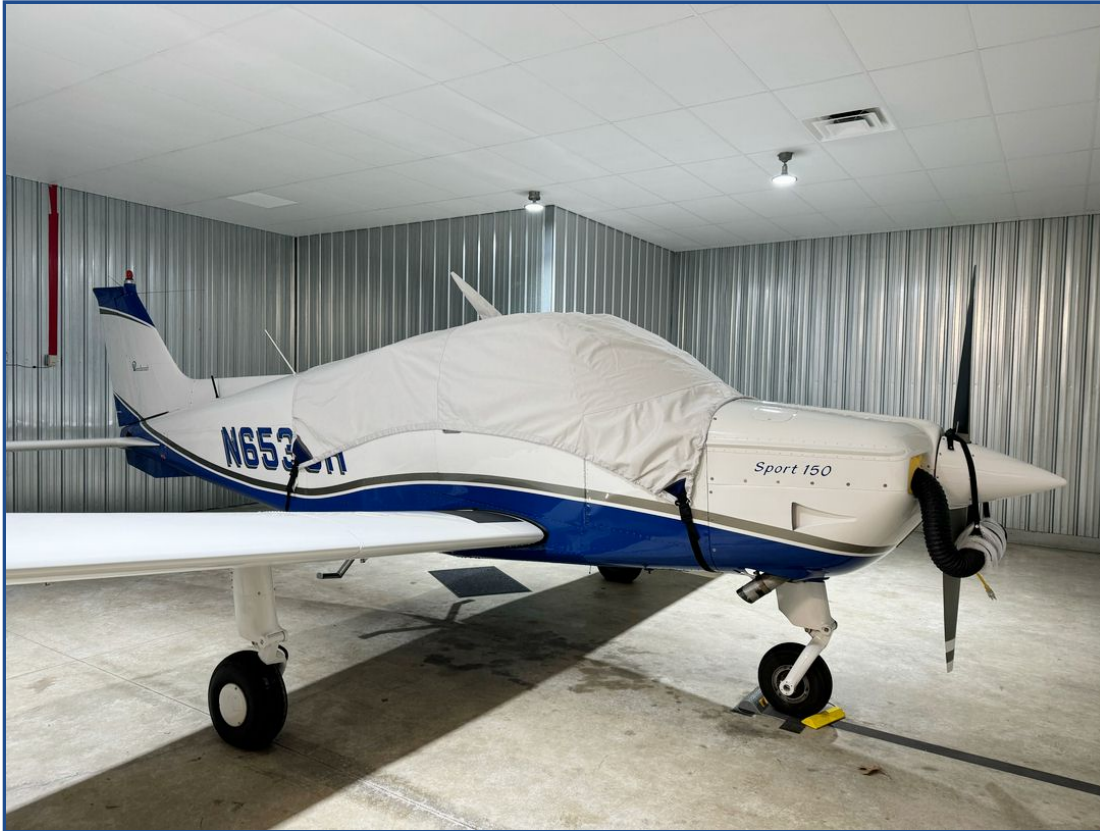
Beech Sport A19 Canopy Cover