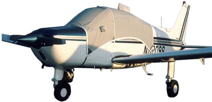
Beech Sport Canopy Cover

Travel Covers are made with Silver Solution-Dyed Polyester fabric and only lined over the windshield to save weight. The material is lightweight and more compact for easy stowage in the aircraft. The polyester material is water resistant, but only intended for occasional use outside. We also have an ultra lightweight material available for fitted hangar dust covers. For daily outdoor use, the non-travel Sunbrella Cover is the best choice.