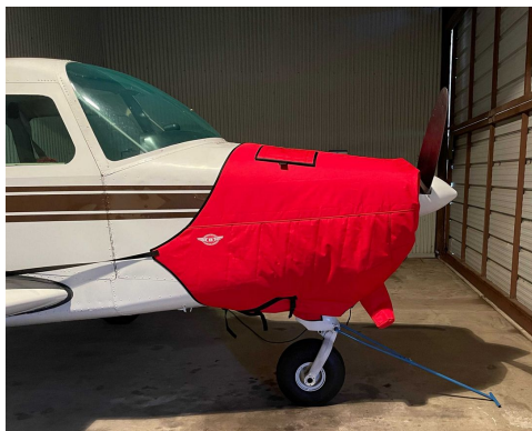
Beech Musketeer Insulated Engine Covers

This cover type is made from Silver Acrylic Sunbrella canvas and is 100% lined with a soft and smooth microfiber. Bruce's Custom Covers developed this material combination especially for aircraft protection. The outer material is medium weight and treated for water resistance, UV resistance and anti-static buildup. The inner lining is a very soft and smooth microfiber to prevent scratching. The material is very reflective, and tests show that the cabin interior temperature can be reduced to near-ambient temperature on the hottest of days. It is water, ice and snow repellent, yet breathable to allow moisture to escape from between the cover and the aircraft surface.