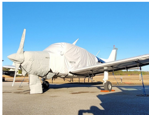
Beech Sundowner Winter Cover Set