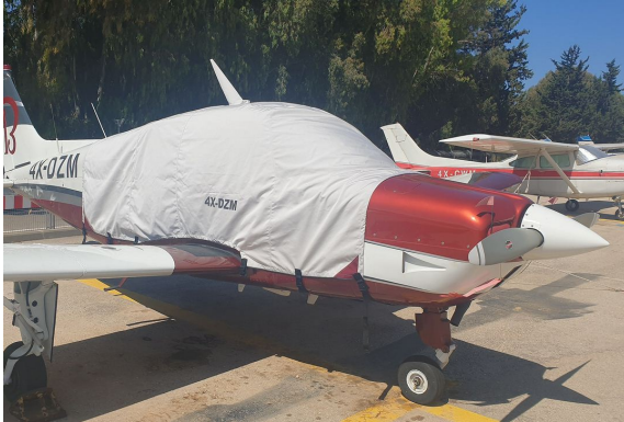
Beech Sierra Extended Canopy Cover

This cover type is made from Silver Acrylic Sunbrella canvas and is 100% lined with a soft and smooth microfiber. Bruce's Custom Covers developed this material combination especially for aircraft protection. The outer material is medium weight and treated for water resistance, UV resistance and anti-static buildup. The inner lining is a very soft and smooth microfiber to prevent scratching. The material is very reflective, and tests show that the cabin interior temperature can be reduced to near-ambient temperature on the hottest of days. It is water, ice and snow repellent, yet breathable to allow moisture to escape from between the cover and the aircraft surface.