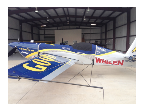
Extra 300SC with NASCAR style custom cover

The Mudry Cap 231 & 232 Canopy/Engine Cover is a one-piece cover (100% lined with microfiber) that is a combination of the Canopy Cover and Engine Cover. This cover will enclose the engine cowl and will extend aft to cover all of the windows. This cover type is made from Silver Acrylic Sunbrella canvas and is 100% lined with a soft and smooth microfiber. Bruce's Custom Covers developed this material combination especially for aircraft protection. The outer material is medium weight and treated for water resistance, UV resistance and anti-static buildup. The inner lining is a very soft and smooth microfiber to prevent scratching. The material is very reflective, and tests show that the cabin interior temperature can be reduced to near-ambient temperature on the hottest of days. It is water, ice and snow repellent, yet breathable to allow moisture to escape from between the cover and the aircraft surface.