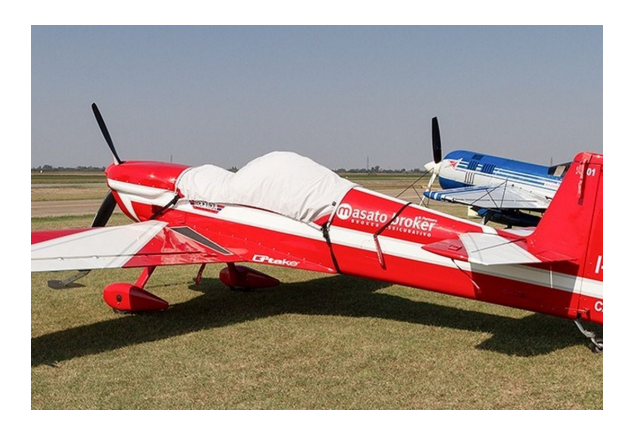
Mudry Cap 231 Canopy Cover