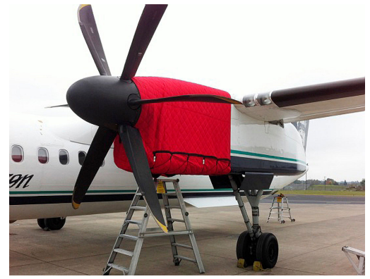
Dash 8-Q400 Insulated Engine Cover