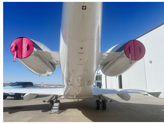
Canadair Challenger 300 Exhaust Plugs