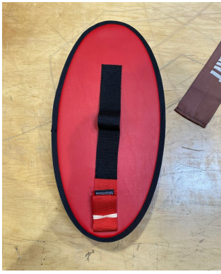
Canadair Challenger 300, 350 APU Exhaust Plug