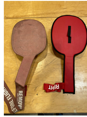
Canadair Challenger 300, 350 Heat Exchanger Exhaust Plug