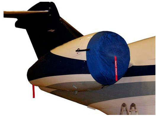
Challenger 300 Intake Covers (set of 2), come in colors