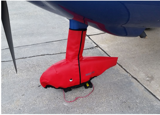
Lancair Columbia Nose Wheelpant/Strut Cover

protection and cover longevity. This heavier more durable material is intended for all weather conditions, such as rain and snow or lots of sun.