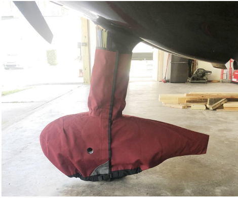
Cessna Corvalis, Lancair Columbia Wheelpant & Strut Cover

protection and cover longevity. This heavier more durable material is intended for all weather conditions, such as rain and snow or lots of sun.