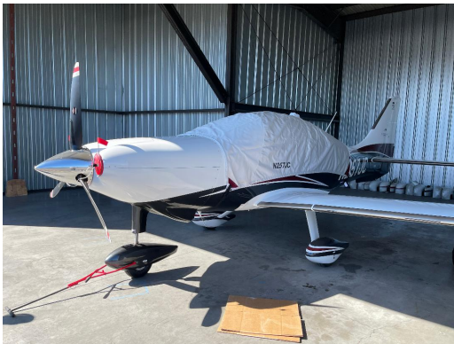
Textron T240 Canopy Cover

This cover type is made from Silver Acrylic Sunbrella canvas and is 100% lined with a soft and smooth microfiber. Bruce's Custom Covers developed this material combination especially for aircraft protection. The outer material is medium weight and treated for water resistance, UV resistance and anti-static buildup. The inner lining is a very soft and smooth microfiber to prevent scratching. The material is very reflective, and tests show that the cabin interior temperature can be reduced to near-ambient temperature on the hottest of days. It is water, ice and snow repellent, yet breathable to allow moisture to escape from between the cover and the aircraft surface.