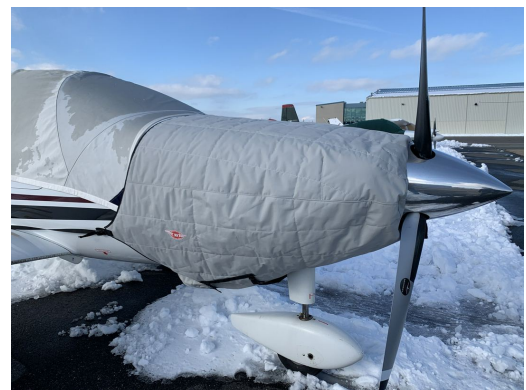
Cessna Corvalis Insulated Engine Cover