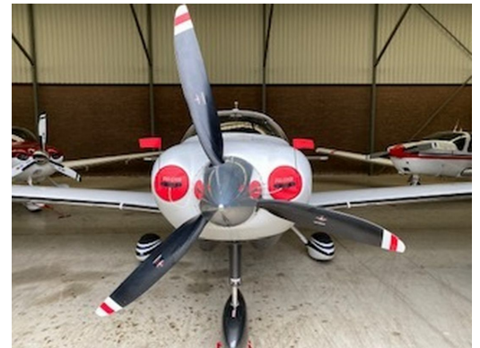
Cessna TTX T240 Engine Inlet Plugs