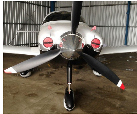
Columbia 350 Engine Plugs