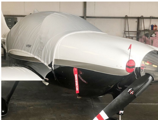
Columbia 350 Travel Cover, Engine Plugs

Travel Covers are made with Silver Solution-Dyed Polyester fabric and only lined over the windshield to save weight. The material is lightweight and more compact for easy stowage in the aircraft. The polyester material is water resistant, but only intended for occasional use outside. We also have an ultra lightweight material available for fitted hangar dust covers. For daily outdoor use, the non-travel Sunbrella Cover is the best choice.