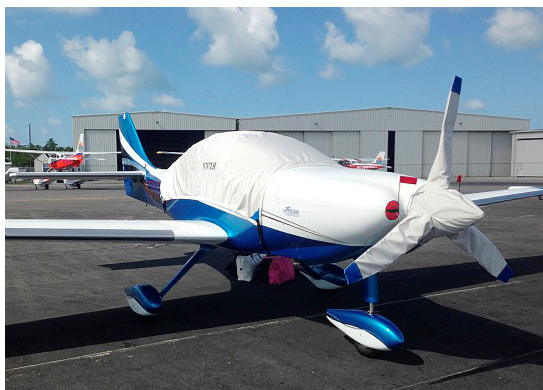
Propellor/Spinner Cover, 3-Blade

This cover type is made from Silver Acrylic Sunbrella canvas and is 100% lined with a soft and smooth microfiber. Bruce's Custom Covers developed this material combination especially for aircraft protection. The outer material is medium weight and treated for water resistance, UV resistance and anti-static buildup. The inner lining is a very soft and smooth microfiber to prevent scratching. The material is very reflective, and tests show that the cabin interior temperature can be reduced to near-ambient temperature on the hottest of days. It is water, ice and snow repellent, yet breathable to allow moisture to escape from between the cover and the aircraft surface.