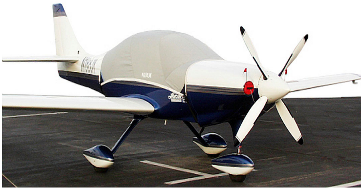
Lancair ES Canopy Cover

This cover type is made from Silver Acrylic Sunbrella canvas and is 100% lined with a soft and smooth microfiber. Bruce's Custom Covers developed this material combination especially for aircraft protection. The outer material is medium weight and treated for water resistance, UV resistance and anti-static buildup. The inner lining is a very soft and smooth microfiber to prevent scratching. The material is very reflective, and tests show that the cabin interior temperature can be reduced to near-ambient temperature on the hottest of days. It is water, ice and snow repellent, yet breathable to allow moisture to escape from between the cover and the aircraft surface.