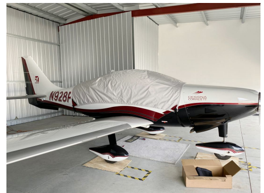
Corvalis TT 400 Canopy Cover