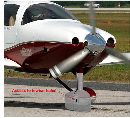
Nose Wheelpant/Strut Cover (illustration)