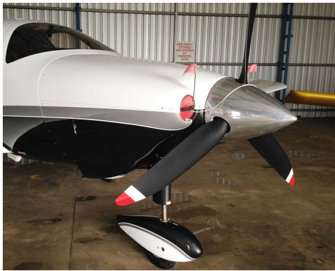
Columbia 350 Engine Plugs

Engine Inlet Plugs are custom fit for your Cessna Corvalis, Corvalis TT, Models T240, 350 & 400 intakes, made with heavy-duty vinyl material, and stuffed with a single block of sculpted urethane foam. Each plug has a zipper that allows the foam to be removed and dried if necessary. Engine plugs have warning flags that are visible from the cockpit or 'remove before flight' streamers sewn onto the face of the plugs. Most plugs are imprinted with the aircraft registration number in black for an extra charge. Storage bag NOT included. Engine plugs may be inserted after flight when the engine is still warm. Engine Inlet Plugs are commonly referred to as Cowl Plugs, Intake Plugs, Cowl Blocks, Engine Blocks, and Engine Bungs. Designed to prevent damage to the aircraft extremities in crowded hangars, these products are made of bright red Naugahyde and thickly padded with a sandwich of closed cell foam.