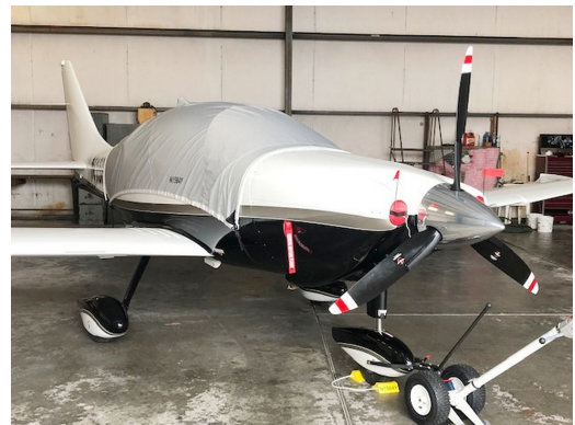
Columbia 350 Travel Cover, Engine Plugs