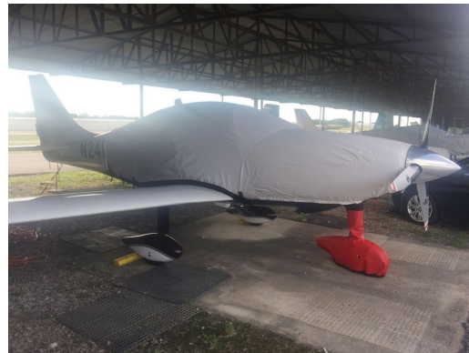
Lancair Columbia Extended Canopy/Engine Cover, Nose Wheelpant Cover