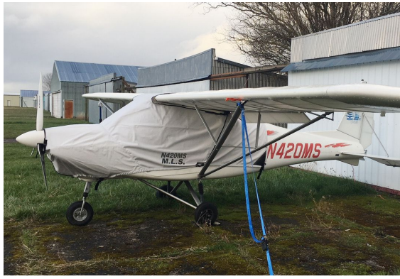
Ikarus C-42 Extended Canopy/Engine Cover