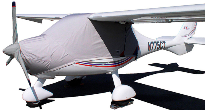
Flight Design CT Canopy/Engine Cover

Travel Covers are made with Silver Solution-Dyed Polyester fabric and only lined over the windshield to save weight. The material is lightweight and more compact for easy stowage in the aircraft. The polyester material is water resistant, but only intended for occasional use outside. We also have an ultra lightweight material available for fitted hangar dust covers. For daily outdoor use, the non-travel Sunbrella Cover is the best choice.