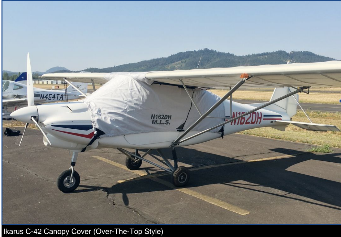
Ikarus C-42 Canopy Cover (Over-The-Top Style)