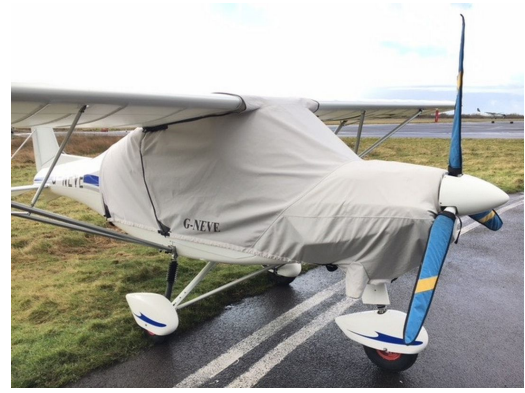
Ikarus C-42 Extended Canopy/Engine Cover