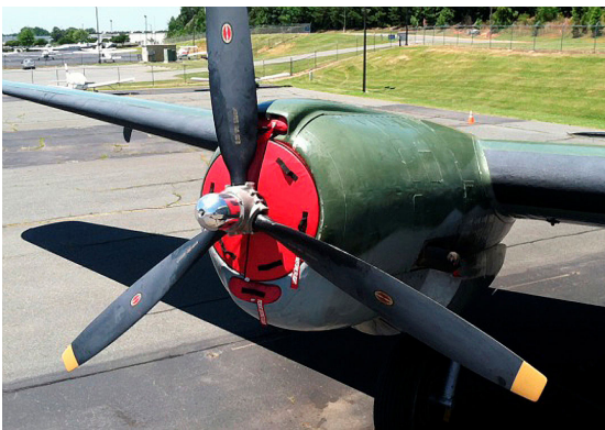
C-46 Radial Engine Intake Plug

Engine Inlet Plugs are custom fit for your Curtiss Wright C-46 Commando intakes, made with heavy-duty vinyl material, and stuffed with a single block of sculpted urethane foam. Each plug has a zipper that allows the foam to be removed and dried if necessary. Engine plugs have warning flags that are visible from the cockpit or 'remove before flight' streamers sewn onto the face of the plugs. Most plugs are imprinted with the aircraft registration number in black for an extra charge. Storage bag NOT included. Engine plugs may be inserted after flight when the engine is still warm. Engine Inlet Plugs are commonly referred to as Cowl Plugs, Intake Plugs, Cowl Blocks, Engine Blocks, and Engine Bunges.