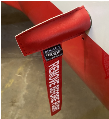
Cessna 501 Angle of Attack Transducer Cover

The Engine Inlet Plugs are custom fit for your Cessna Citation I (500/501) intakes, made with heavy-duty vinyl material, and stuffed with a single block of sculpted urethane foam. Each plug has a zipper that allows the foam to be removed and dried if necessary. Engine plugs have 'remove before flight' streamers sewn onto the face of the plugs. Most plugs are imprinted with the aircraft registration number in black for an extra charge. Storage bag NOT included. Engine plugs may be inserted after flight when the engine is still warm. Engine Inlet Plugs are commonly referred to as Cowl Plugs, Intake Plugs, Cowl Blocks, Engine Blocks, and Engine Bungs.