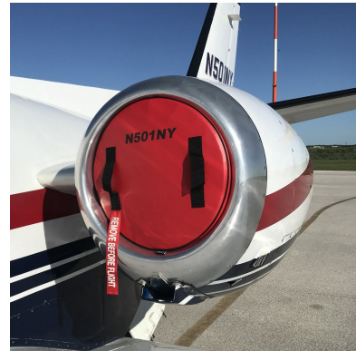
Citation 501 Intake/Exhaust Plug Set