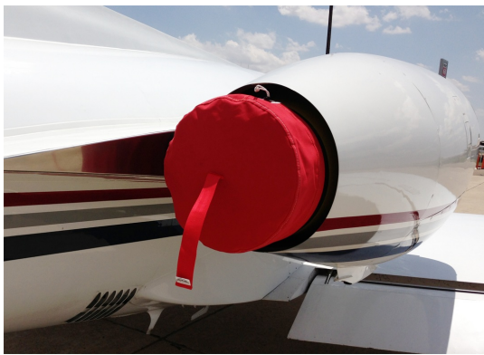
Cessna Citation Stallion Exhaust Cover

The Cessna Citation I (500/501) Intake Covers are designed to install easily yet be completely storable. A spring steel hoop is sewn into the hem of each cover, allowing them to be installed without climbing onto the wing or using a stepladder. To store the covers the spring steel hoop folds like a band-saw blade into three nesting rings. Each cover folds into a compact circular bundle which is stored in the included duffle bag, yet they unfold quickly for use. The Tri-Fold Ring cover is made of medium weight nylon which is available in a variety of colors to match the paint trim. Each cover set comes complete with installation and folding instructions. The aircraft's registration number can be silkscreened onto the cover for an extra charge.