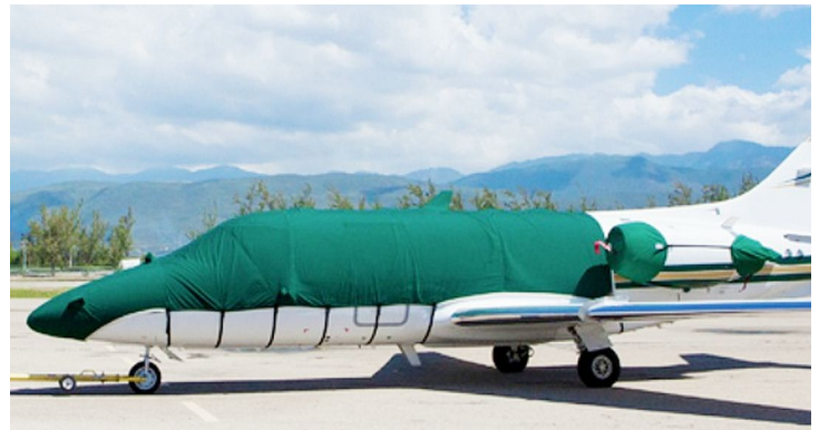
Raytheon Beechjet 400 Fuselage/Nose Cover, Engine Covers