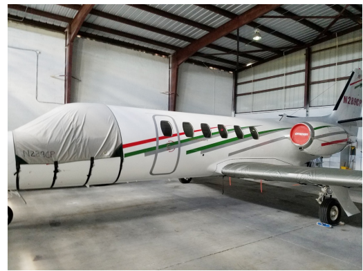
Cessna Citation II Cockpit Cover, Wing Covers