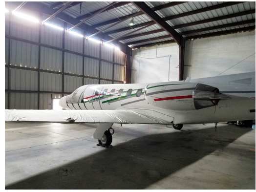
Cessna Citation II Cockpit Cover, Wing Covers