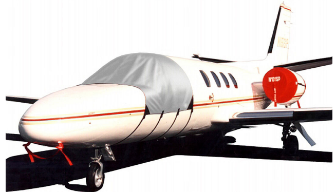
Cessna Citation Windshield Cover, Engine Cover set and Pitot Covers