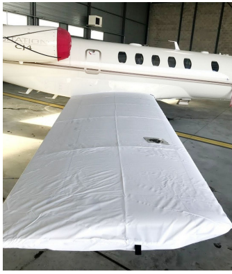
Cessna Citation CJ-4 Wing Covers, test fit cover