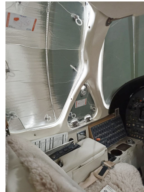
Cessna Citation I & II Cockpit HeatShields