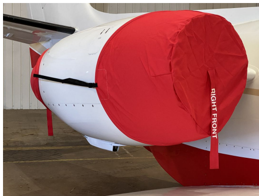
Cessna 501 Engine Covers NO TR's

The Cessna Citation I (500/501) Intake Covers are designed to install easily yet be completely storable. A spring steel hoop is sewn into the hem of each cover, allowing them to be installed without climbing onto the wing or using a stepladder. To store the covers the spring steel hoop folds like a band-saw blade into three nesting rings. Each cover folds into a compact circular bundle which is stored in the included duffle bag, yet they unfold quickly for use. The Tri-Fold Ring cover is made of medium weight nylon which is available in a variety of colors to match the paint trim. Each cover set comes complete with installation and folding instructions. The aircraft's registration number can be silkscreened onto the cover for an extra charge.