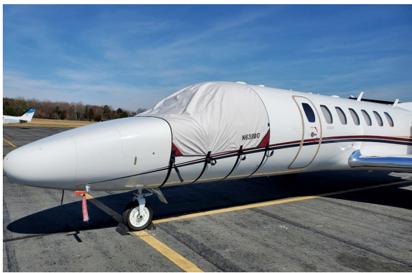
Cessna Citation 560 Cockpit Cover

This cover type is made from Silver Acrylic Sunbrella canvas and is 100% lined with a soft and smooth microfiber. Bruce's Custom Covers developed this material combination especially for aircraft protection. The outer material is medium weight and treated for water resistance, UV resistance and anti-static buildup. The inner lining is a very soft and smooth microfiber to prevent scratching. The material is very reflective, and tests show that the cabin interior temperature can be reduced to near-ambient temperature on the hottest of days. It is water, ice and snow repellent, yet breathable to allow moisture to escape from between the cover and the aircraft surface.