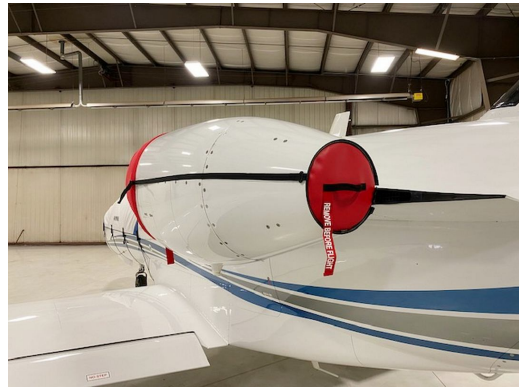
Cessna 510 Engine Inlet Covers &amp; Exhaust Plugs