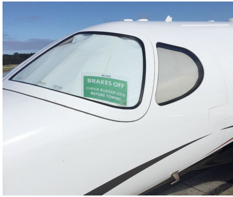
Cessna Mustang 510 Cockpit Heatshields