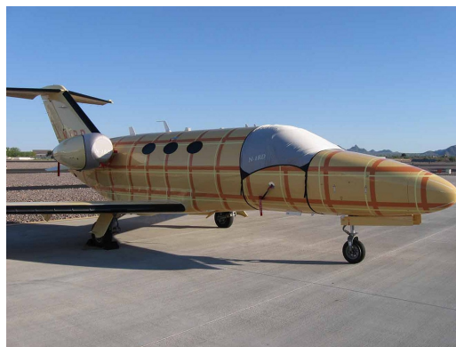
Citation Mustang Light Weight Windshield & Engine Covers