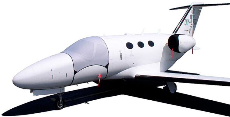
Citation Mustang Light Weight Travel Windshield Cover, "Bikini" type Engine Cover Set

Travel Covers are made with Silver Solution-Dyed Polyester fabric and only lined over the windshield to save weight. The material is lightweight and more compact for easy stowage in the aircraft. The polyester material is water resistant, but only intended for occasional use outside. We also have an ultra lightweight material available for fitted hangar dust covers. For daily outdoor use, the non-travel Sunbrella Cover is the best choice.