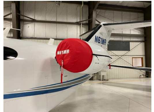
Cessna 510 Engine Inlet Covers & Exhaust Plugs