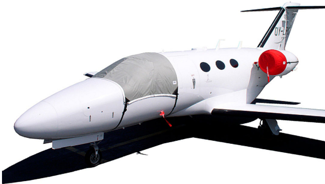
Citation Mustang Windshield Cover, Intake Cover/Exhaust Plug Set, Pitot Covers

The Cessna Mustang 510 Intake/Exhaust Plugs are custom fit for the intake and exhaust openings, made with heavy-duty vinyl material, and stuffed with a single block of sculpted urethane foam. Each plug has a zipper that allows the foam to be removed and dried if necessary. Engine plugs have 'remove before flight' streamers sewn onto the face of the plugs. Most plugs are imprinted with the aircraft registration number in black. Engine plugs may be inserted after flight when the engine is still warm. Engine Inlet Plugs are commonly referred to as Cowl Plugs, Intake Plugs, Cowl Blocks, Engine Blocks, and Engine Bungs.