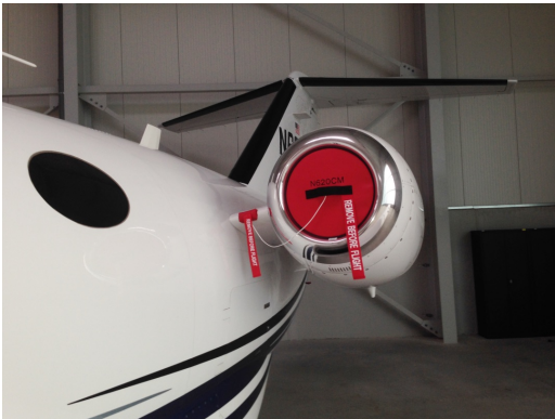
Citation Mustang Engine Intake Plugs

The Engine Inlet Plugs are custom fit for your Cessna Mustang 510 intakes, made with heavy-duty vinyl material, and stuffed with a single block of sculpted urethane foam. Each plug has a zipper that allows the foam to be removed and dried if necessary. Engine plugs have 'remove before flight' streamers sewn onto the face of the plugs. Most plugs are imprinted with the aircraft registration number in black for an extra charge. Storage bag NOT included. Engine plugs may be inserted after flight when the engine is still warm. Engine Inlet Plugs are commonly referred to as Cowl Plugs, Intake Plugs, Cowl Blocks, Engine Blocks, and Engine Bungs.