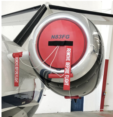
Cessna Mustang 510 Engine Inlet Plugs, Includes Intercooler Intake & Exhaust And Gen. Plugs

The Engine Inlet Plugs are custom fit for your Cessna Mustang 510 intakes, made with heavy-duty vinyl material, and stuffed with a single block of sculpted urethane foam. Each plug has a zipper that allows the foam to be removed and dried if necessary. Engine plugs have 'remove before flight' streamers sewn onto the face of the plugs. Most plugs are imprinted with the aircraft registration number in black for an extra charge. Storage bag NOT included. Engine plugs may be inserted after flight when the engine is still warm. Engine Inlet Plugs are commonly referred to as Cowl Plugs, Intake Plugs, Cowl Blocks, Engine Blocks, and Engine Bungs.