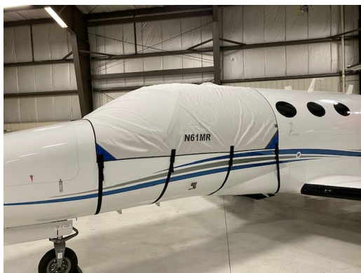
Cessna 510 Cockpit Cover extends to cover door

This cover type is made from Silver Acrylic Sunbrella canvas and is 100% lined with a soft and smooth microfiber. Bruce's Custom Covers developed this material combination especially for aircraft protection. The outer material is medium weight and treated for water resistance, UV resistance and anti-static buildup. The inner lining is a very soft and smooth microfiber to prevent scratching. The material is very reflective, and tests show that the cabin interior temperature can be reduced to near-ambient temperature on the hottest of days. It is water, ice and snow repellent, yet breathable to allow moisture to escape from between the cover and the aircraft surface.