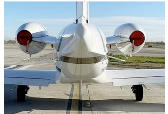
Cessna Mustang Exhaust Plugs