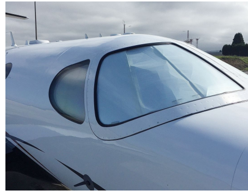
Cessna Mustang 510 Cockpit Heatshields