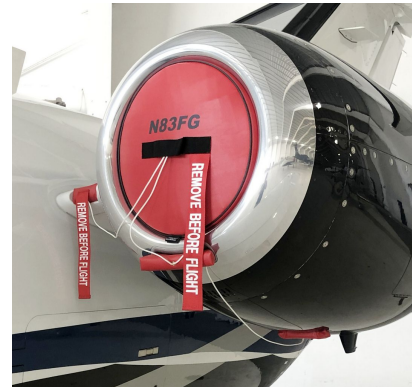
Cessna Mustang 510 Engine Inlet Plugs, Includes Intercooler Intake & Exhaust And Gen. Plugs