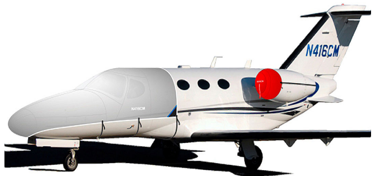
Citation Mustang Cockpit/Door/Nose Cover, Engine Inlet Cover