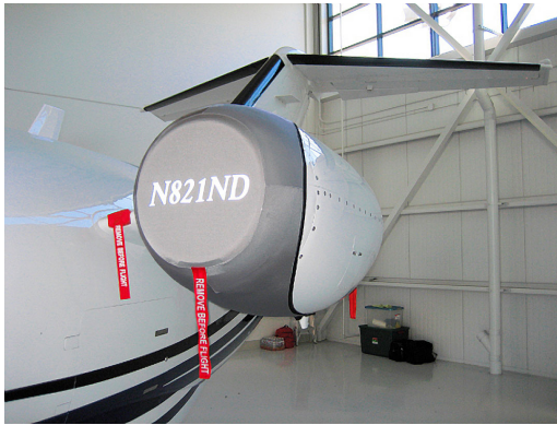
Citation Mustang Intake/Exhaust Cover, "Bikini" Type and leading edge Pylon inlet plugs

The Engine Inlet Plugs are custom fit for your Cessna Mustang 510 intakes, made with heavy-duty vinyl material, and stuffed with a single block of sculpted urethane foam. Each plug has a zipper that allows the foam to be removed and dried if necessary. Engine plugs have 'remove before flight' streamers sewn onto the face of the plugs. Most plugs are imprinted with the aircraft registration number in black for an extra charge. Storage bag NOT included. Engine plugs may be inserted after flight when the engine is still warm. Engine Inlet Plugs are commonly referred to as Cowl Plugs, Intake Plugs, Cowl Blocks, Engine Blocks, and Engine Bungs.