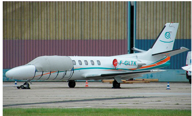
Citation Windshield Cover, to back of door