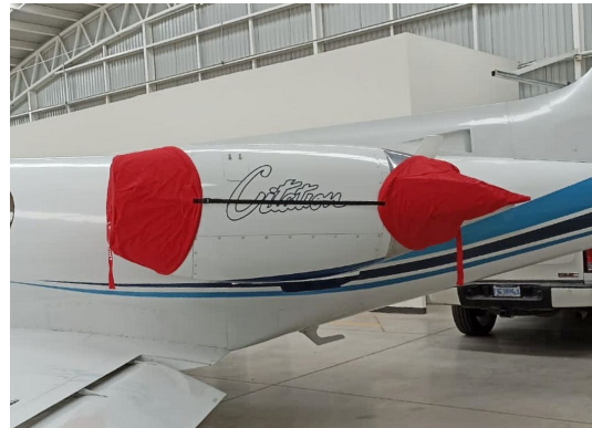
Cessna 551 Citation II SP Engine covers (with thrust reversers, smooth gen. inlet)