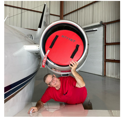
Citation II Engine Plugs