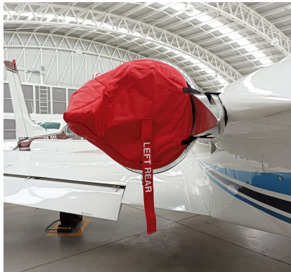
Cessna 551 Citation II SP Engine covers (with thrust reversers, smooth gen. inlet)

The Cessna Citation II (550, 551, UC-35A, with JT15D) Intake Covers are designed to install easily yet be completely storable. A spring steel hoop is sewn into the hem of each cover, allowing them to be installed without climbing onto the wing or using a stepladder. To store the covers the spring steel hoop folds like a band-saw blade into three nesting rings. Each cover folds into a compact circular bundle which is stored in the included duffle bag, yet they unfold quickly for use. The Tri-Fold Ring cover is made of medium weight nylon which is available in a variety of colors to match the paint trim. Each cover set comes complete with installation and folding instructions. The aircraft's registration number can be silkscreened onto the cover for an extra charge.