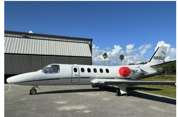
Cessna Citation 550 Intake Cover