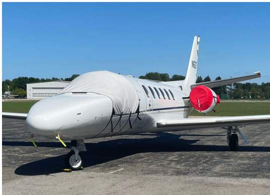
Cessna 550 Citation II

This cover type is made from Silver Acrylic Sunbrella canvas and is 100% lined with a soft and smooth microfiber. Bruce's Custom Covers developed this material combination especially for aircraft protection. The outer material is medium weight and treated for water resistance, UV resistance and anti-static buildup. The inner lining is a very soft and smooth microfiber to prevent scratching. The material is very reflective, and tests show that the cabin interior temperature can be reduced to near-ambient temperature on the hottest of days. It is water, ice and snow repellent, yet breathable to allow moisture to escape from between the cover and the aircraft surface.