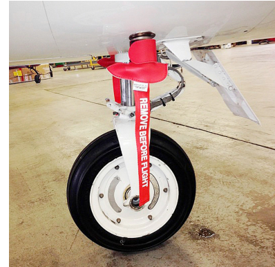
Rosemount Probe Cover