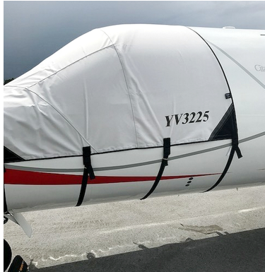
Cessna Citationjet V Ultra (560) Cockpit Cover

This cover type is made from Silver Acrylic Sunbrella canvas and is 100% lined with a soft and smooth microfiber. Bruce's Custom Covers developed this material combination especially for aircraft protection. The outer material is medium weight and treated for water resistance, UV resistance and anti-static buildup. The inner lining is a very soft and smooth microfiber to prevent scratching. The material is very reflective, and tests show that the cabin interior temperature can be reduced to near-ambient temperature on the hottest of days. It is water, ice and snow repellent, yet breathable to allow moisture to escape from between the cover and the aircraft surface.