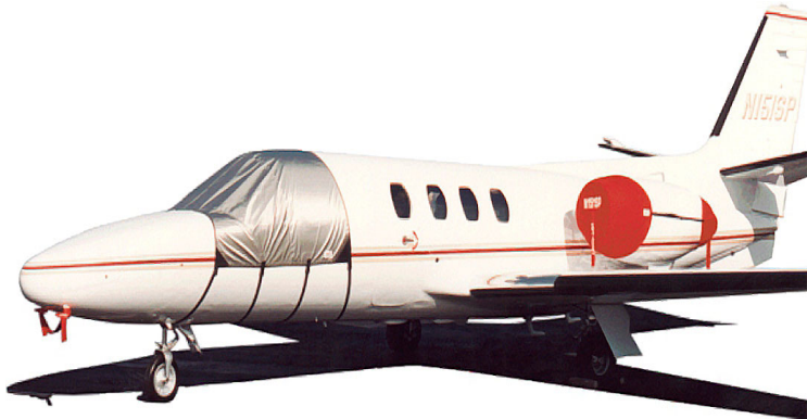
Cessna Citation Windshield, Pitot and Engine Covers

The Cessna Citationjet V Ultra (560) Intake/Exhaust Plugs are custom fit for the intake and exhaust openings, made with heavy-duty vinyl material, and stuffed with a single block of sculpted urethane foam. Each plug has a zipper that allows the foam to be removed and dried if necessary. Engine plugs have 'remove before flight' streamers sewn onto the face of the plugs. Most plugs are imprinted with the aircraft registration number in black. Engine plugs may be inserted after flight when the engine is still warm. Engine Inlet Plugs are commonly referred to as Cowl Plugs, Intake Plugs, Cowl Blocks, Engine Blocks, and Engine Bungs.