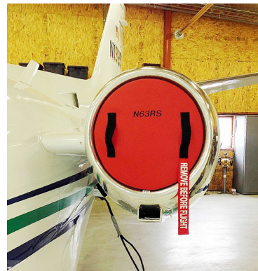
Cessna Citation S2 Intake Plugs