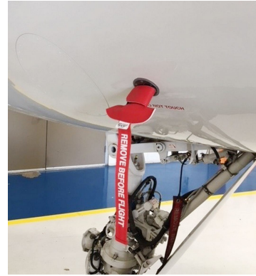
Grumman Gulfstream G-V Rosemont/TAT Cover