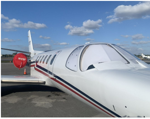
Cessna Citation S550