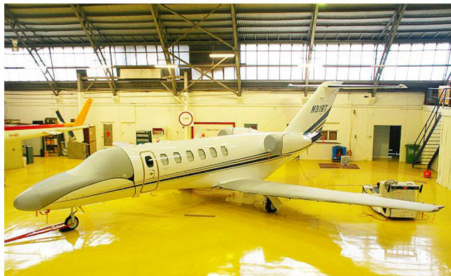
Cessna Citationjet CJ3 Cockpit/Nose, Engine & Wings Travel Covers

WINTER USE MATERIAL - Made with Solution-Dyed Polyester fabric, this option is intended for seasonal use to aid in deicing, rain mitigation, or for occasional travel. The material is lighter and more compact, but more susceptible to UV damage and may have a shorter useful life if used continuously outside than the all-year use material.