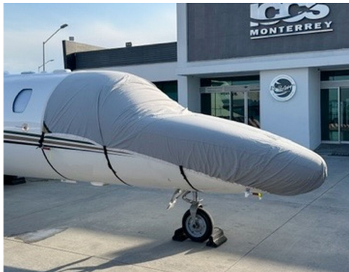
Cessna Citationjet 525B Travel Weight Cockpit/Nose Cover

This cover type is made from Silver Acrylic Sunbrella canvas and is 100% lined with a soft and smooth microfiber. Bruce's Custom Covers developed this material combination especially for aircraft protection. The outer material is medium weight and treated for water resistance, UV resistance and anti-static buildup. The inner lining is a very soft and smooth microfiber to prevent scratching. The material is very reflective, and tests show that the cabin interior temperature can be reduced to near-ambient temperature on the hottest of days. It is water, ice and snow repellent, yet breathable to allow moisture to escape from between the cover and the aircraft surface.