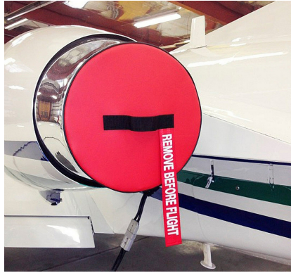
Cessna Citation S2 Exhaust Plugs

The Engine Inlet Plugs are custom fit for your Cessna Citationjet V Ultra (560) intakes, made with heavy-duty vinyl material, and stuffed with a single block of sculpted urethane foam. Each plug has a zipper that allows the foam to be removed and dried if necessary. Engine plugs have 'remove before flight' streamers sewn onto the face of the plugs. Most plugs are imprinted with the aircraft registration number in black for an extra charge. Storage bag NOT included. Engine plugs may be inserted after flight when the engine is still warm. Engine Inlet Plugs are commonly referred to as Cowl Plugs, Intake Plugs, Cowl Blocks, Engine Blocks, and Engine Bungs.