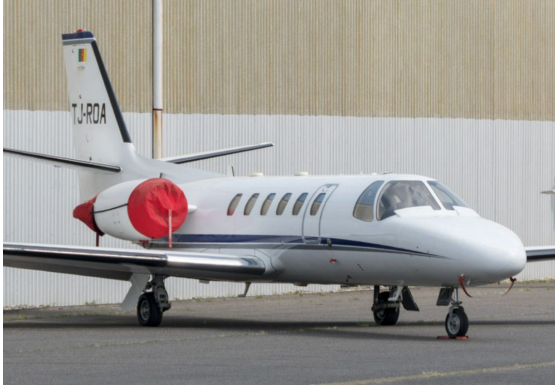
Cessna Citation II Bravo Engine Covers

The Cessna Citationjet V Ultra (560) Intake/Exhaust Plugs are custom fit for the intake and exhaust openings, made with heavy-duty vinyl material, and stuffed with a single block of sculpted urethane foam. Each plug has a zipper that allows the foam to be removed and dried if necessary. Engine plugs have 'remove before flight' streamers sewn onto the face of the plugs. Most plugs are imprinted with the aircraft registration number in black. Engine plugs may be inserted after flight when the engine is still warm. Engine Inlet Plugs are commonly referred to as Cowl Plugs, Intake Plugs, Cowl Blocks, Engine Blocks, and Engine Bungs.