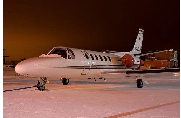
Cessna Citation 550 Engine Cover Set