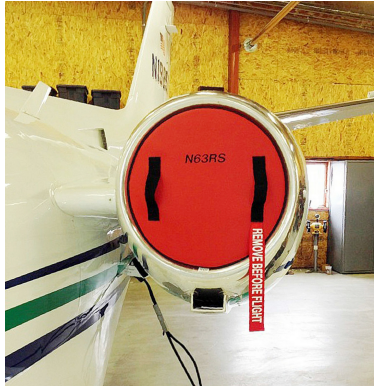
Cessna Citation S2 Intake Plugs

The Engine Inlet Plugs are custom fit for your Cessna Citationjet V Ultra (560) intakes, made with heavy-duty vinyl material, and stuffed with a single block of sculpted urethane foam. Each plug has a zipper that allows the foam to be removed and dried if necessary. Engine plugs have 'remove before flight' streamers sewn onto the face of the plugs. Most plugs are imprinted with the aircraft registration number in black for an extra charge. Storage bag NOT included. Engine plugs may be inserted after flight when the engine is still warm. Engine Inlet Plugs are commonly referred to as Cowl Plugs, Intake Plugs, Cowl Blocks, Engine Blocks, and Engine Bungs.