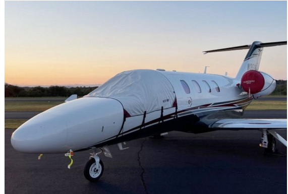
Cessna Citation Jet 525 Cockpit Cover