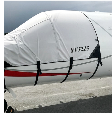
Cessna Citationjet V Ultra (560) Cockpit Cover