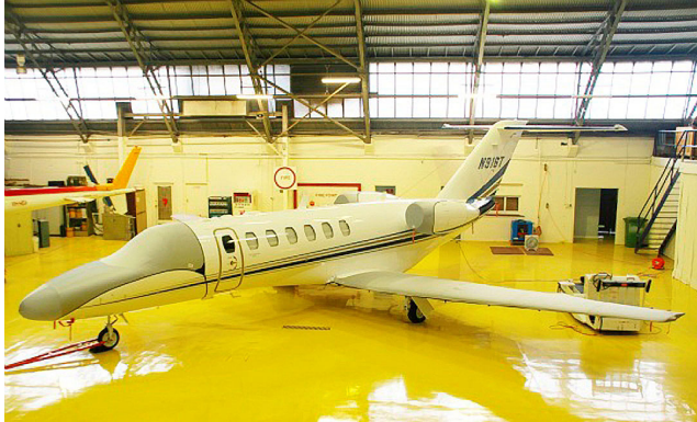
Cessna Citationjet CJ3 Cockpit/Nose, Engine & Wings Travel Covers

WINTER USE MATERIAL - Made with Solution-Dyed Polyester fabric, this option is intended for seasonal use to aid in deicing, rain mitigation, or for occasional travel. The material is lighter and more compact, but more susceptible to UV damage and may have a shorter useful life if used continuously outside than the all-year use material.