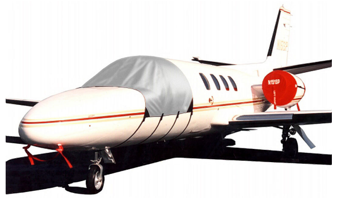
Cessna Citation Windshield Cover, Engine Cover set and Pitot Covers