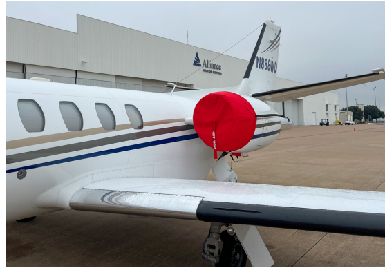
Cessna 550 Intake Covers & Exhaust Plugs, includes wedge plug for nacelle recommended (set of 6)