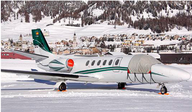
Cessna Citation 550 Windshield Cover

This cover type is made from Silver Acrylic Sunbrella canvas and is 100% lined with a soft and smooth microfiber. Bruce's Custom Covers developed this material combination especially for aircraft protection. The outer material is medium weight and treated for water resistance, UV resistance and anti-static buildup. The inner lining is a very soft and smooth microfiber to prevent scratching. The material is very reflective, and tests show that the cabin interior temperature can be reduced to near-ambient temperature on the hottest of days. It is water, ice and snow repellent, yet breathable to allow moisture to escape from between the cover and the aircraft surface.