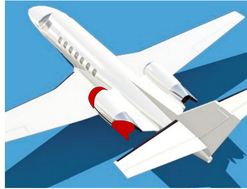
Cessna Citation II with TR's Exhaust Cover Illustration