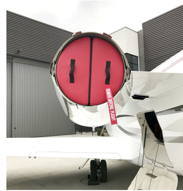
Cessna Citation 680 Exhaust Plugs, folding type