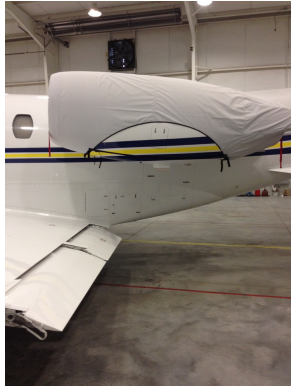
Cessna Citation 560XL Upper Nacelle/Brightwork Covers

The Cessna Citation II Bravo Intake/Exhaust Plugs are custom fit for the intake and exhaust openings, made with heavy-duty vinyl material, and stuffed with a single block of sculpted urethane foam. Each plug has a zipper that allows the foam to be removed and dried if necessary. Engine plugs have 'remove before flight' streamers sewn onto the face of the plugs. Most plugs are imprinted with the aircraft registration number in black. Engine plugs may be inserted after flight when the engine is still warm. Engine Inlet Plugs are commonly referred to as Cowl Plugs, Intake Plugs, Cowl Blocks, Engine Blocks, and Engine Bungs.