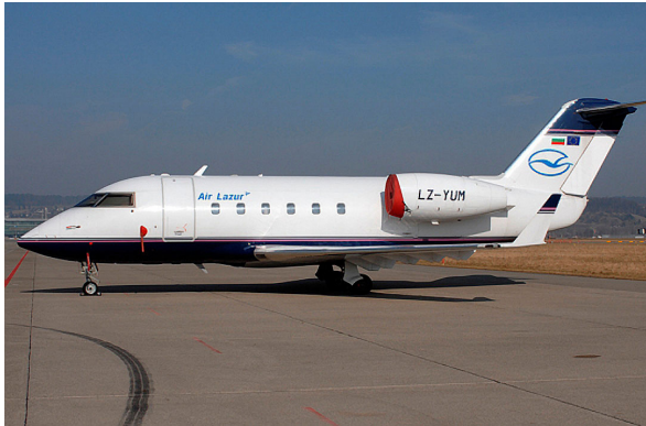
Challenger 600 Intake Covers

The Canadair Challenger 600 Intake Covers are designed to install easily yet be completely storable. A spring steel hoop is sewn into the hem of each cover, allowing them to be installed without climbing onto the wing or using a stepladder. To store the covers the spring steel hoop folds like a band-saw blade into three nesting rings. Each cover folds into a compact circular bundle which is stored in the included duffle bag, yet they unfold quickly for use. The Tri-Fold Ring cover is made of medium weight nylon which is available in a variety of colors to match the paint trim. Each cover set comes complete with installation and folding instructions. The aircraft's registration number can be silkscreened onto the cover for an extra charge.