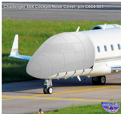
Challenger 601/604 Cockpit/Nose Cover, illustration