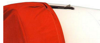
Alternate Intake Cover Design