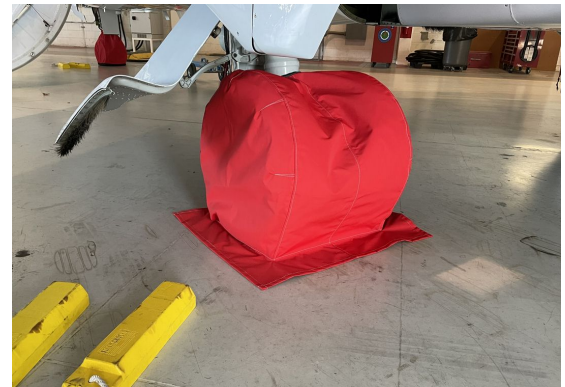
Canadair Challenger 605 Main Gear Tire Covers