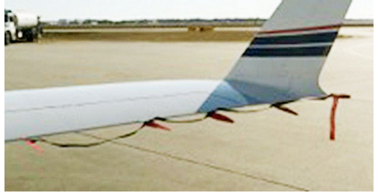
Static Wick Covers