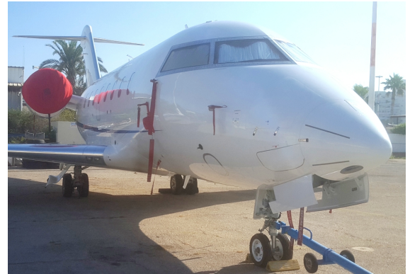
Canadair Challenger 601/604 Engine Covers, 4-strap design, 3D model Canadair Challenger 604, 605, 650, 850 Intake Covers