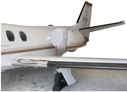
Cessna Citation "Bikini" Type Engine Covers: Extremely Light & Portable