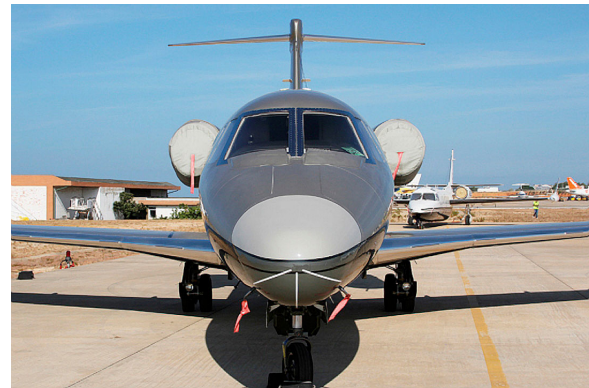
Citation III 650 Engine Covers Set