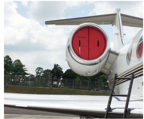
Grumman Gulfstream G450 Intake Plugs