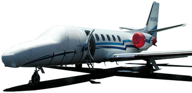
Cessna Citation Nose/Cockpit Cover, Engine Covers