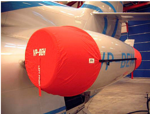
Falcon 900 Sovereign Engine Covers

The Cessna Citation Latitude (680A) Intake/Exhaust Plugs are custom fit for the intake and exhaust openings, made with heavy-duty vinyl material, and stuffed with a single block of sculpted urethane foam. Each plug has a zipper that allows the foam to be removed and dried if necessary. Engine plugs have 'remove before flight' streamers sewn onto the face of the plugs. Most plugs are imprinted with the aircraft registration number in black. Engine plugs may be inserted after flight when the engine is still warm. Engine Inlet Plugs are commonly referred to as Cowl Plugs, Intake Plugs, Cowl Blocks, Engine Blocks, and Engine Bungs.