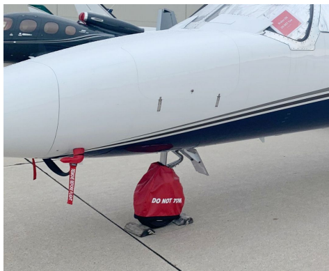
Cessna Citation Nose Tire Cover

ALL-YEAR USE MATERIAL - Made with Silver Acrylic Sunbrella canvas, the all-year use material is the best option for sun protection and cover longevity. This heavier more durable material is intended for all weather conditions, such as rain and snow or lots of sun.