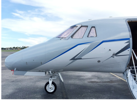
Cessna Citation 650 Cockpit HeataShields

Cockpit Heatshields are interior sunshades for the aircraft's cockpit. The product is a unique composite of closed-cell foam with a silver mylar finish. The semi-rigid design is stiff enough to stand inside the window framing. The set folds up flat and is easily stored in the included storage sleeve. Some designs may require velcro and suction cups. Our Heatshields for jets are offered white side out because some aircraft manufacturers have issued advisories against reflective window inserts due to potential heat damage. A Heatshield is an excellent short-term remedy for cockpit overheating, but an external fabric cover is more effective for long-term protection.