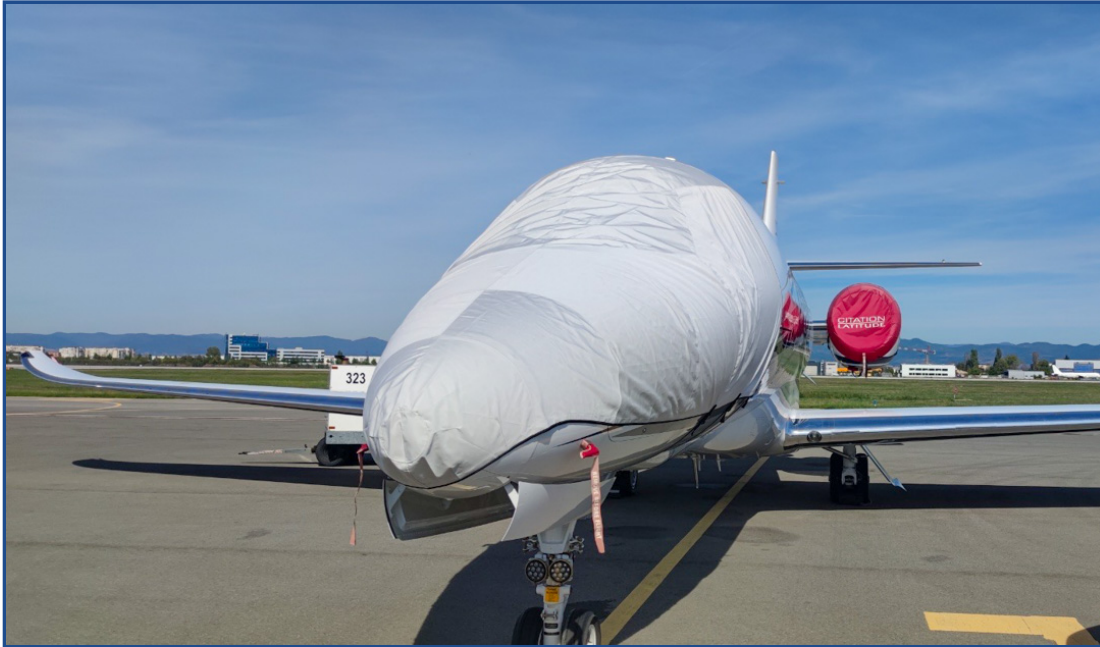
Cessna Citation Latitude (680A) Cockpit/Nose Cover, Doesn't Cover Pitot Tubes